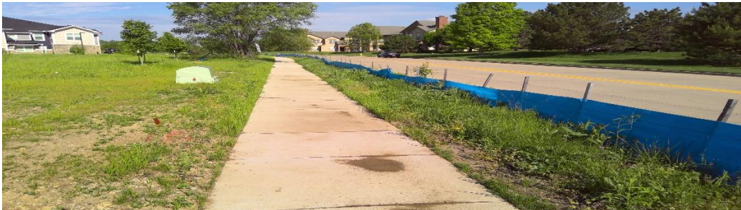
North perimeter silt fence is good