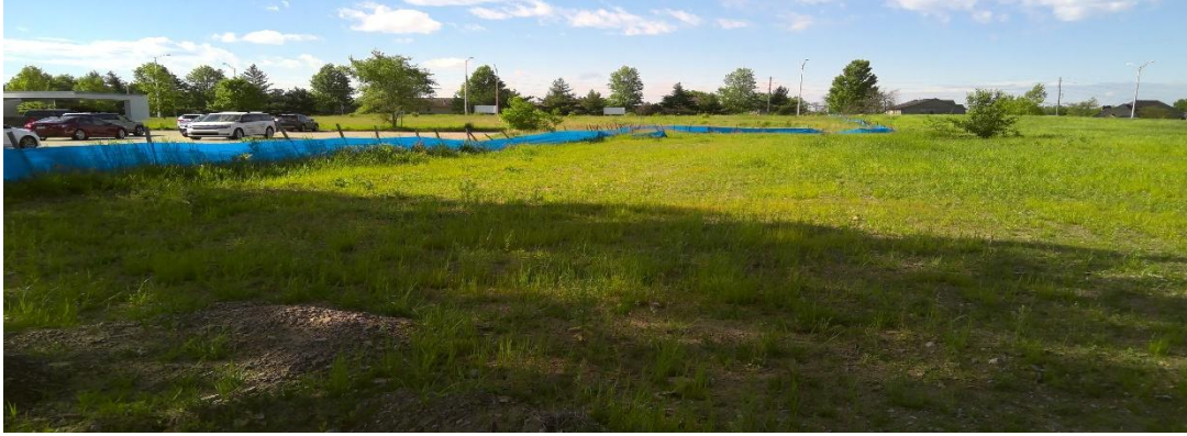
East perimeter silt fence ok, area vegetation is sparse not 70%