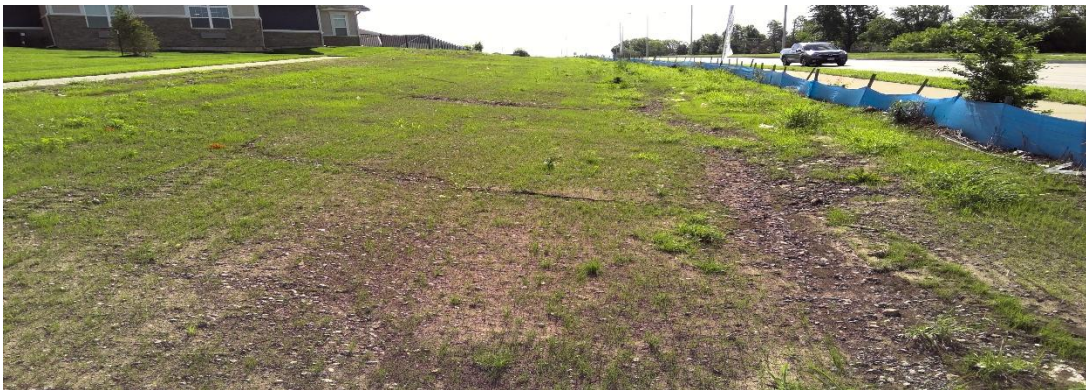
South perimeter vegetation sparse, not at 70%, perimeter silt fence intact