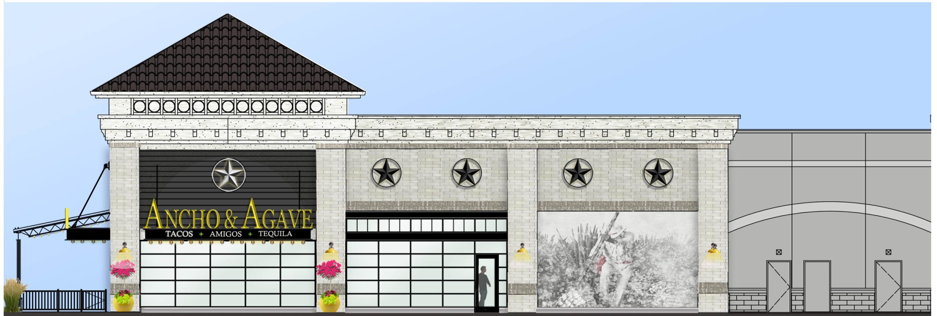
AFTER - EAST ELEVATION - 1/8"=1'-0"