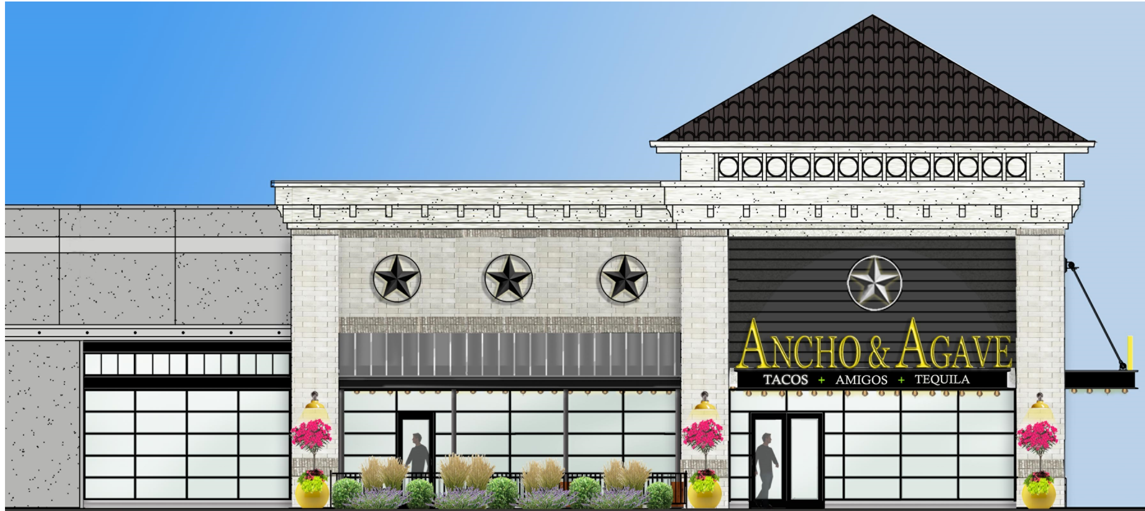
AFTER - SOUTH ELEVATION 1/8" = 1'-0"