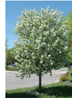
SPRING SNOW CRABAPPLE TREE