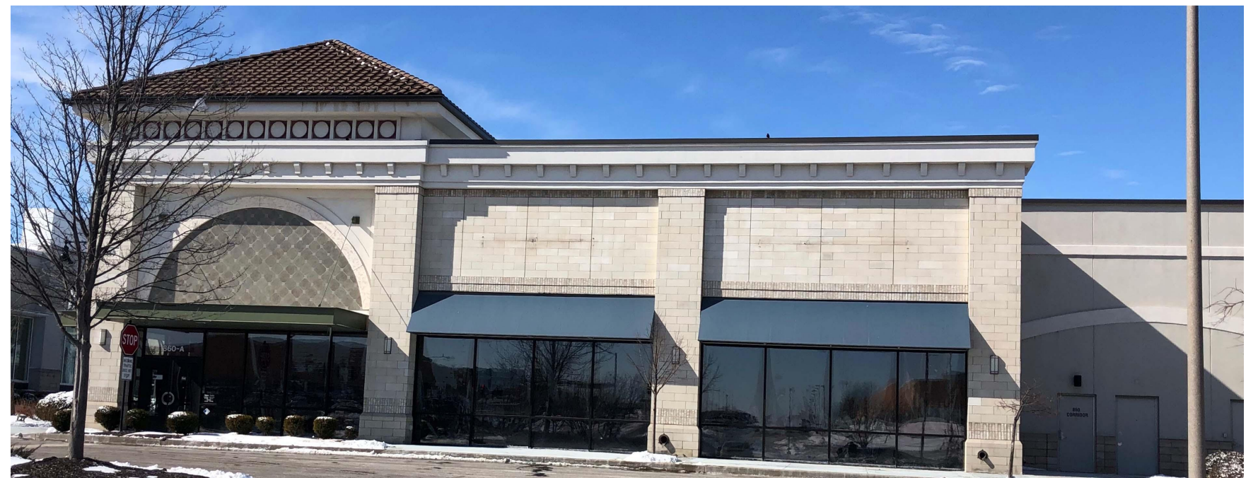
BEFORE - EAST ELEVATION