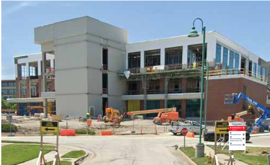
PROPOSED - NTS