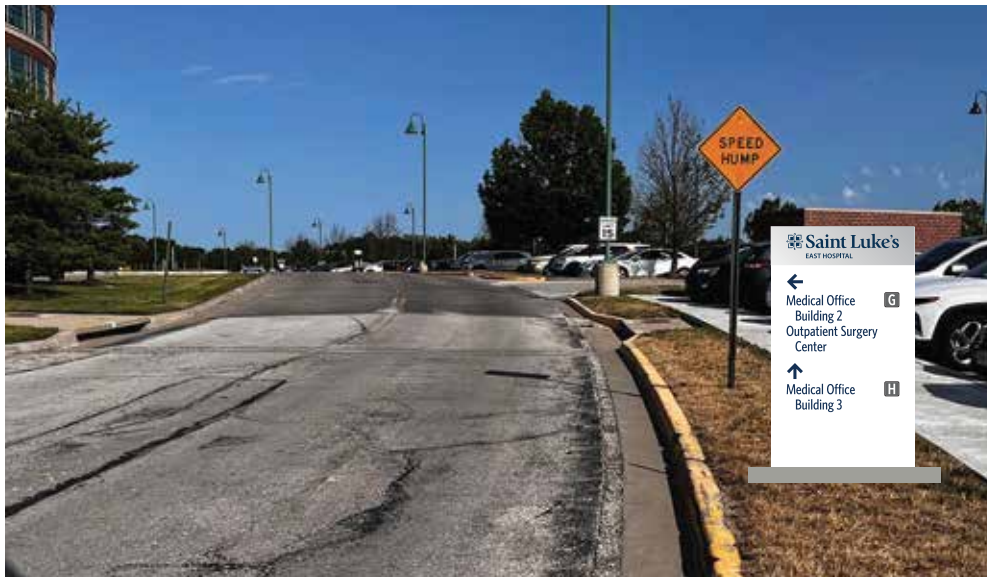
PROPOSED - DIRECTIONAL 1