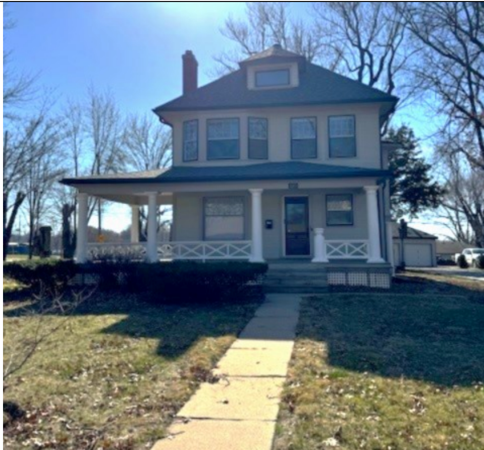
Figure 1 – Existing single-family house