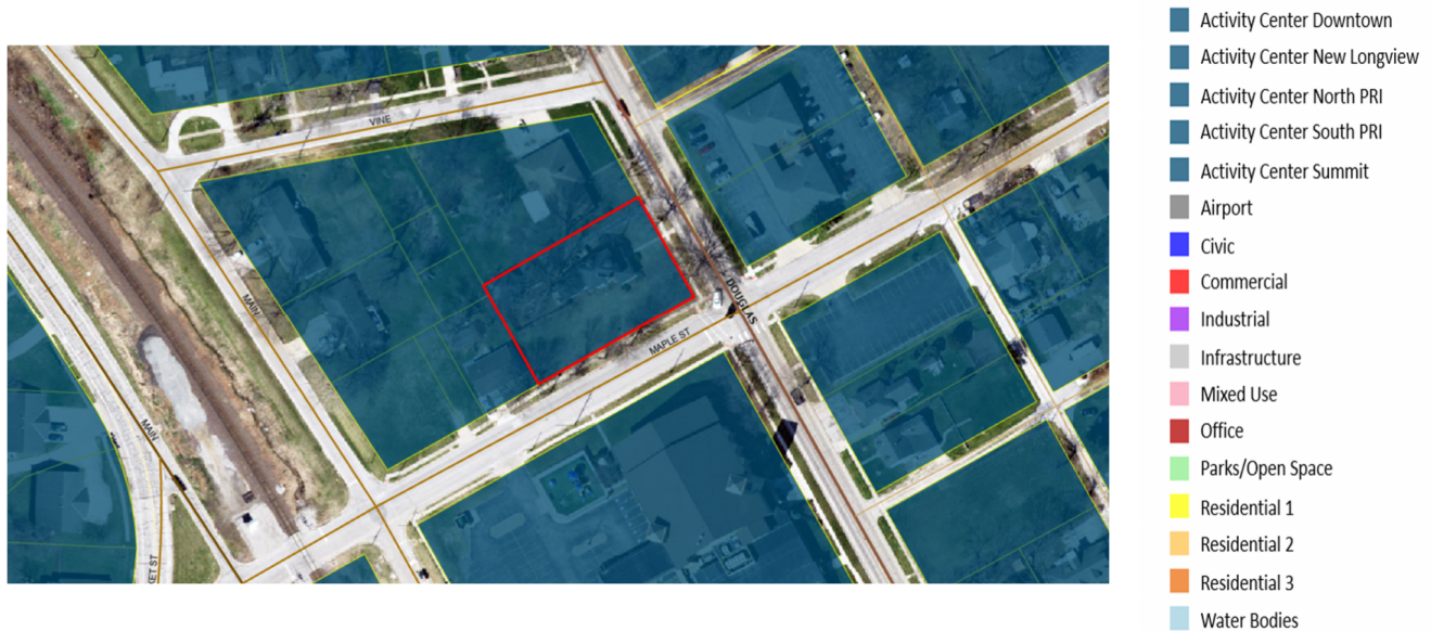
Figure 4 – Future Land Use Map & Legend

The Ignite! Comprehensive Plan promotes various strategies to build long-term economic prosperity and resiliency in the City's economy. One objective established in the Comprehensive Plan is to increase business retention and grow business activity. Also, the future land use plan within the Ignite! Comprehensive Plan denotes the subject property as part of the Downtown Activity Center which states office uses as complementary. Approval of the subject Rezoning and PDP applications to allow a business office on the subject property supports continued economic viability of the site by growing business activity.