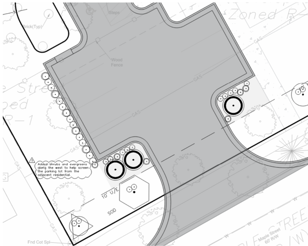
Figure 3 - Proposed Parking Lot Landscaping