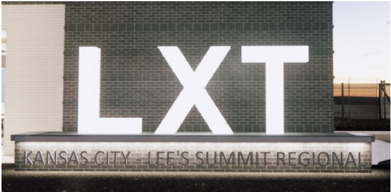
Figure 2 – Rendering of night view of proposed monument sign.