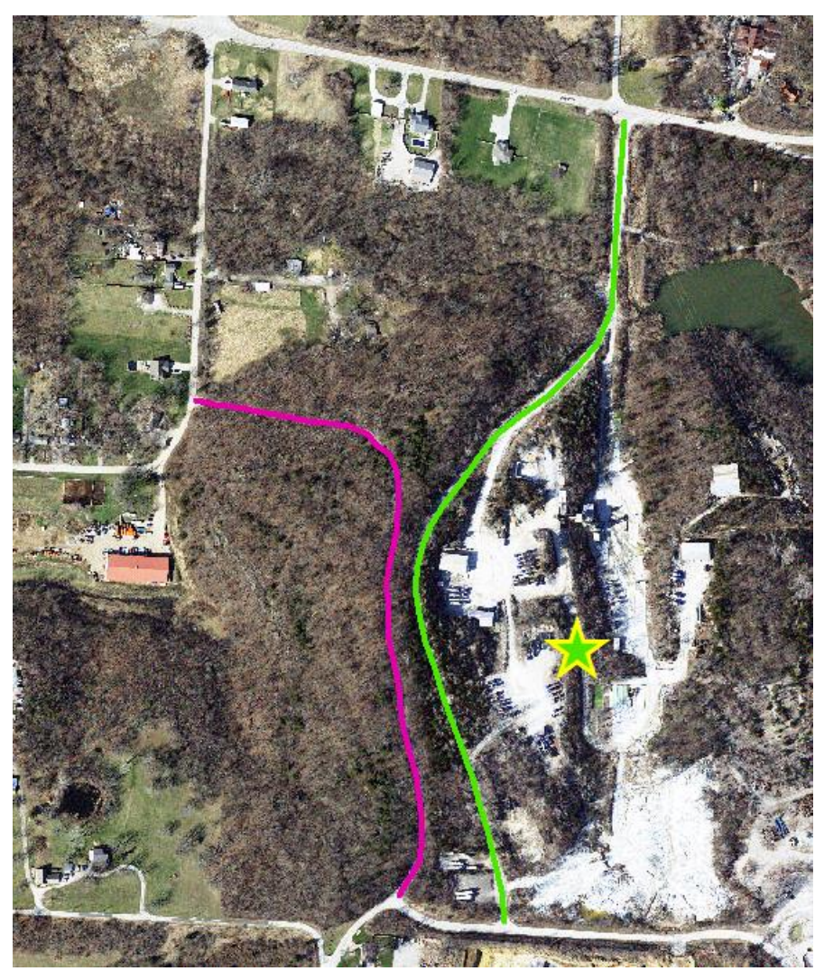
Figure 5 - Alternate route (in magenta) to NW Quarry Park Rd from Noland Rd (in KCMO). Emergency access (in green) to NW Quarry Park Rd via Valley Garden Dr through existing ready-mix concrete batch plant location (green star).

illustrated below. There is currently no short-term solution to fix the collapsed road section and no intention to restore the section of NW Quarry Park Road that collapsed. The City is currently investigating and evaluating long-term options. The City has kept City Council and impacted area residents apprised of its efforts to provide and maintain safe and adequate access under the present circumstances, which includes collaboration with the existing ready-mix concrete plant to provide emergency access through its site via Valley Garden Dr (see map below) during inclement weather considering the steep road grade of the route that currently provides alternate access to the area from Bannister Road. The City is also pursuing permanent alternate access along public ways to Bannister Road in collaboration with Kansas City, Missouri, that does not have inclement weather concerns. The Development Services Department has not received any communication from impacted area residents as it relates to the road situation or the subject special use permit application.