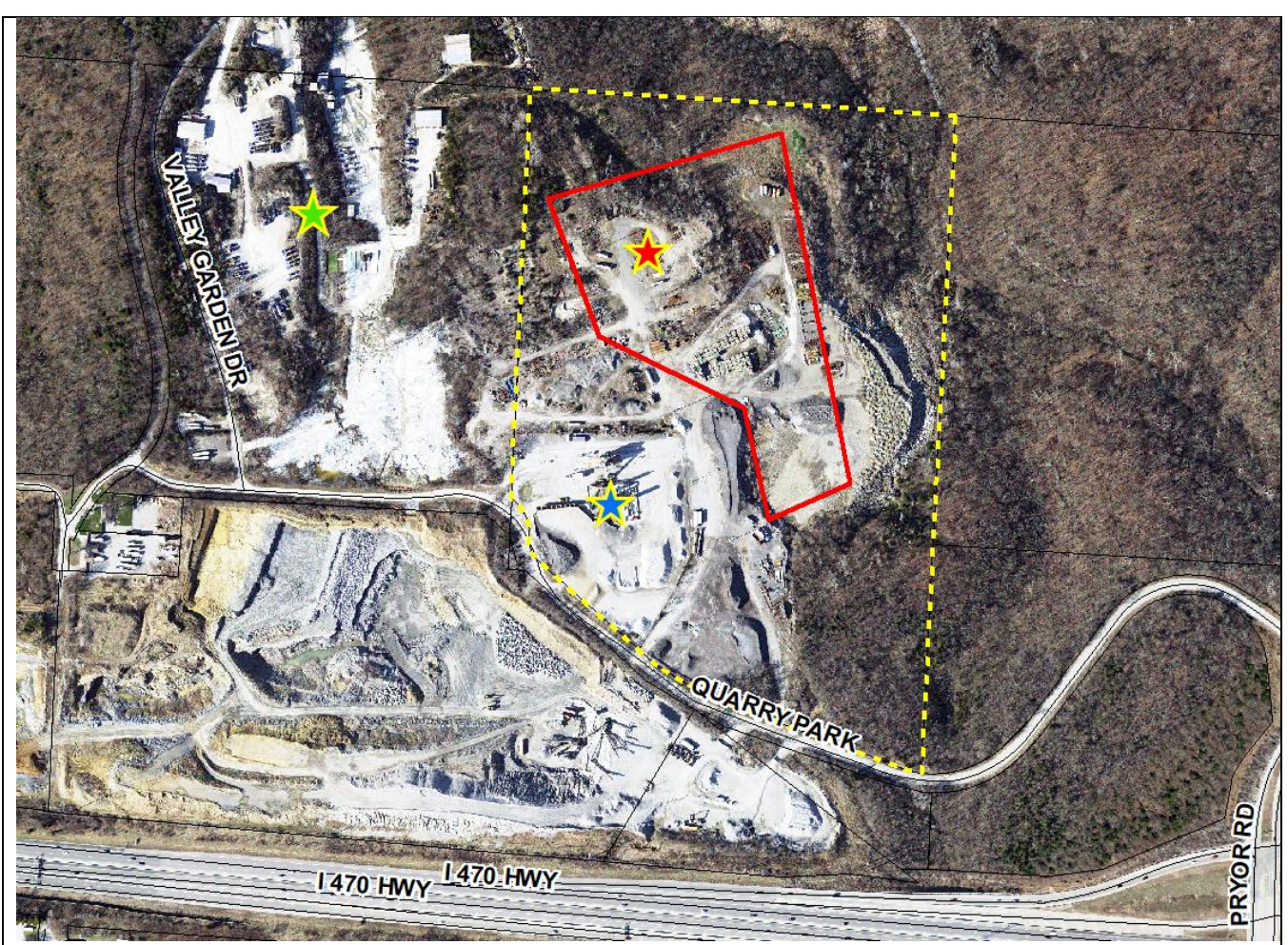
Figure 1 – View of the proposed 15-acre concrete batch plant lease area (outlined in red) and proposed concrete batch plant location (red star). Also depicted are the 53-acre parent parcel (dashed in yellow); the existing asphalt plant location (blue star); and the existing ready-mix concrete batch plant location on the abutting property to the west (green star).