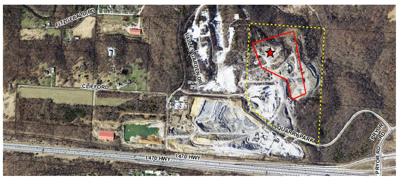
Figure 3 - Aerial photo showing NW Clifford Rd and NW Quarry Park Rd connection to NW Pryor Rd.

Access to the subject property has not been affected by the collapsed road section and thus access to the proposed concrete batch plant site is maintained via NW Pryor Rd as illustrated below. The collapsed road section is located west of the access drive entrance to the concrete batch plant site. The City has posted road closure signage and placed barriers on either end of NW Quarry Park Rd to block access to the collapsed road section.