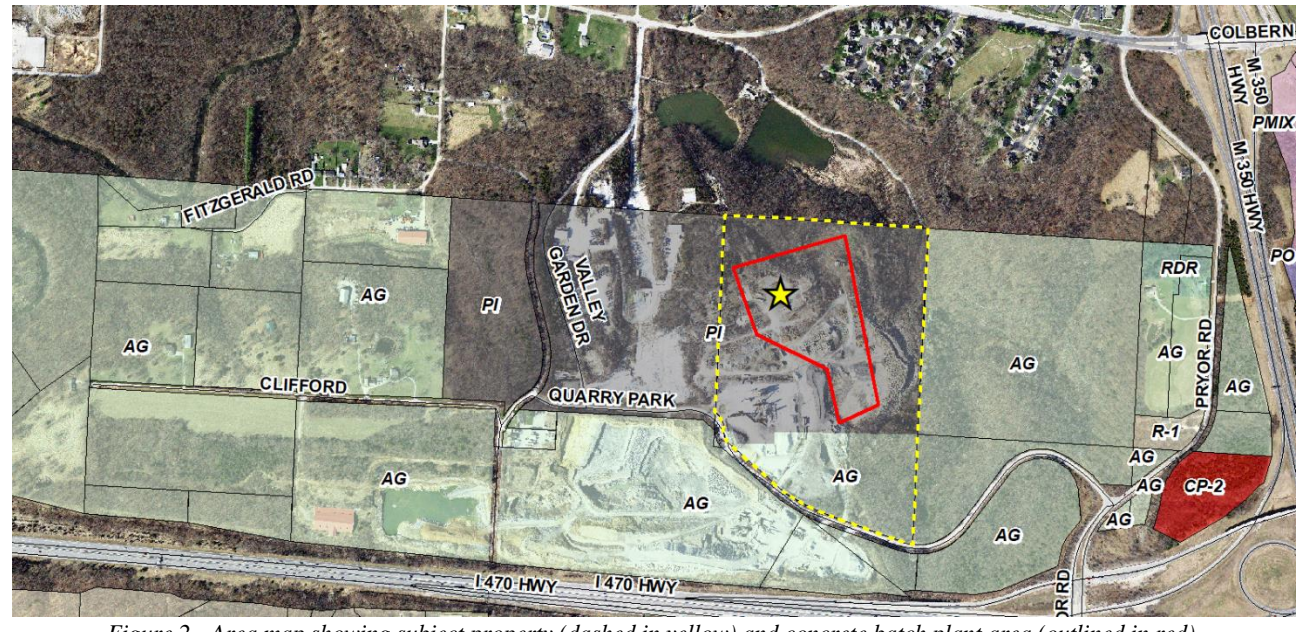
Figure 2 - Area map showing subject property (dashed in yellow) and concrete batch plant area (outlined in red).

The subject property is located along NW Quarry Park Rd, west of NW Pryor Rd and immediately south of the city limits shared with Kansas City. NW Quarry Park Rd and NW Clifford Rd are separate but connected east-west streets that bisect the area. Area development is a mix of single-family residences on large acreage parcels and industrial uses (e.g. asphalt plant, concrete plant and quarrying operations). There are also several undeveloped large acreage tracts. The residential uses are located on the west half of the area, while the industrial uses, including an existing ready-mix concrete plant, are located on the east half of the area.