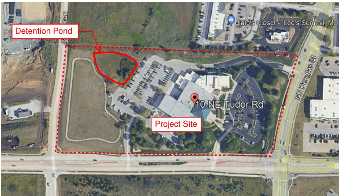
Figure 1: Project Location Aerial

Governing design criteria is based on the APWA 5600 comprehensive control and the capacity of the downstream system to convey discharge during the systems design events.