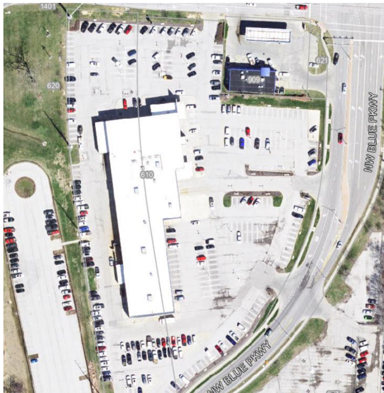
Figure 1 - 2023 aerial photo

The subject property is an existing car dealership and automotive repair facility with frontage along NW Blue Parkway and NW Chipman Road. One access point is provided to the lot along NW Chipman Road, and two more along NW Blue Parkway.