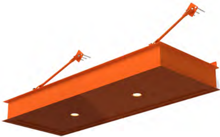
Pre-Fabricated Building Canopy

NOTE: Architectural drawings must be provided in order to determine the quantity. When complete, please email this form and the site plans to dunkin@unistructures.com