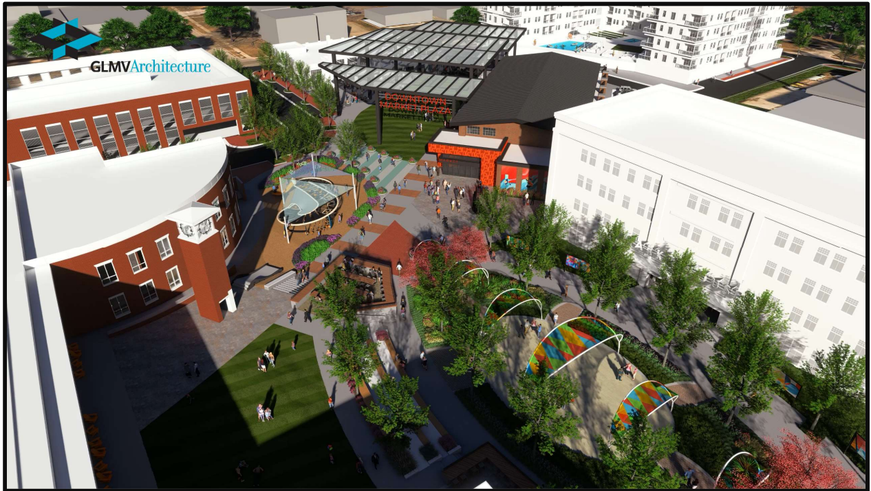
Figure 2 Conceptual Rendering of Market Bldg. and Plaza, view from atop City Hall looking North.