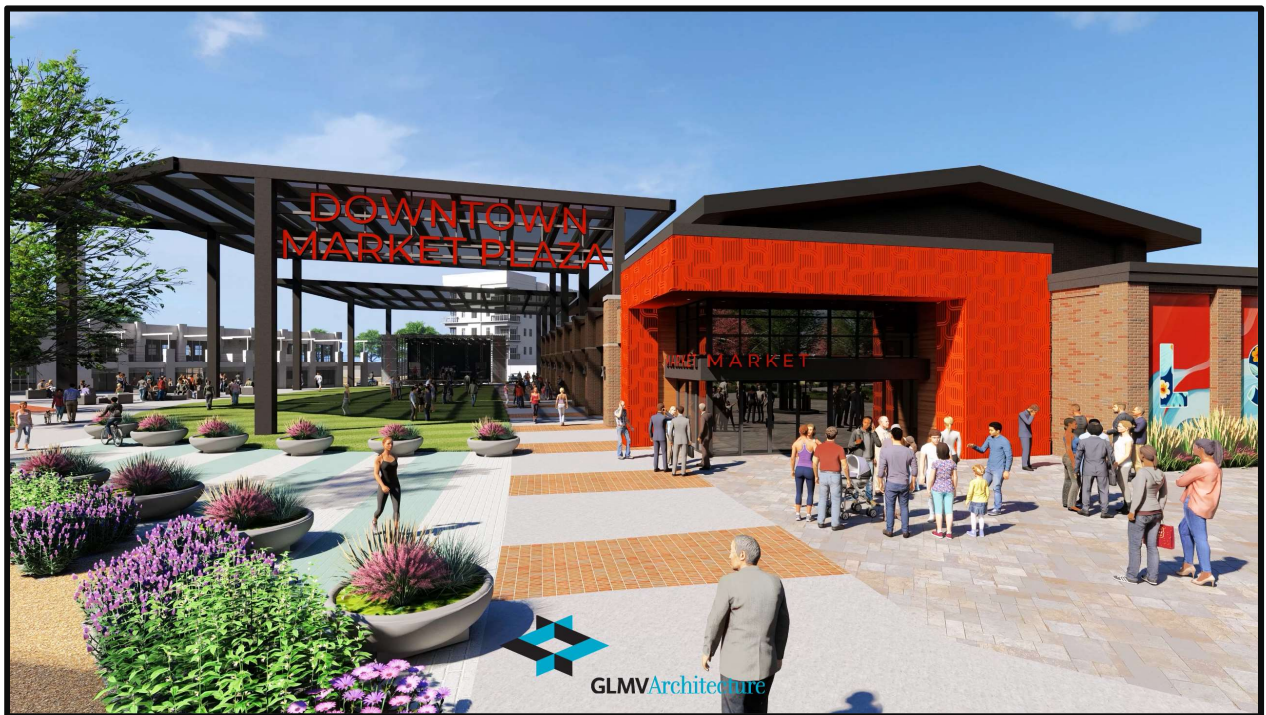
Figure 3 Conceptual Rendering of Market Bldg. View to main entry, including proposed canopy structure.