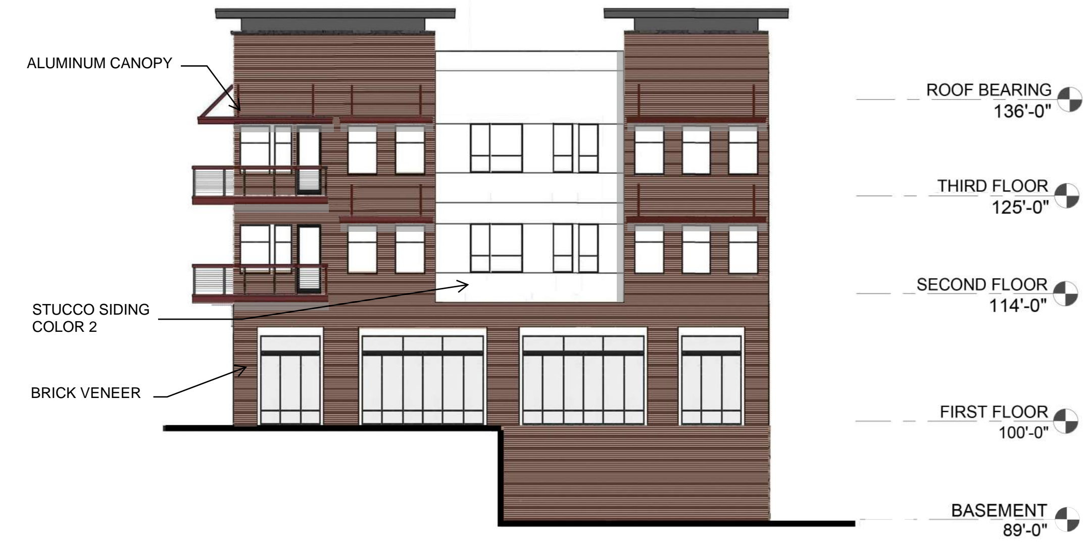
2 BLDG 4 SOUTH ELEVATION 3/32" = 1'-0"