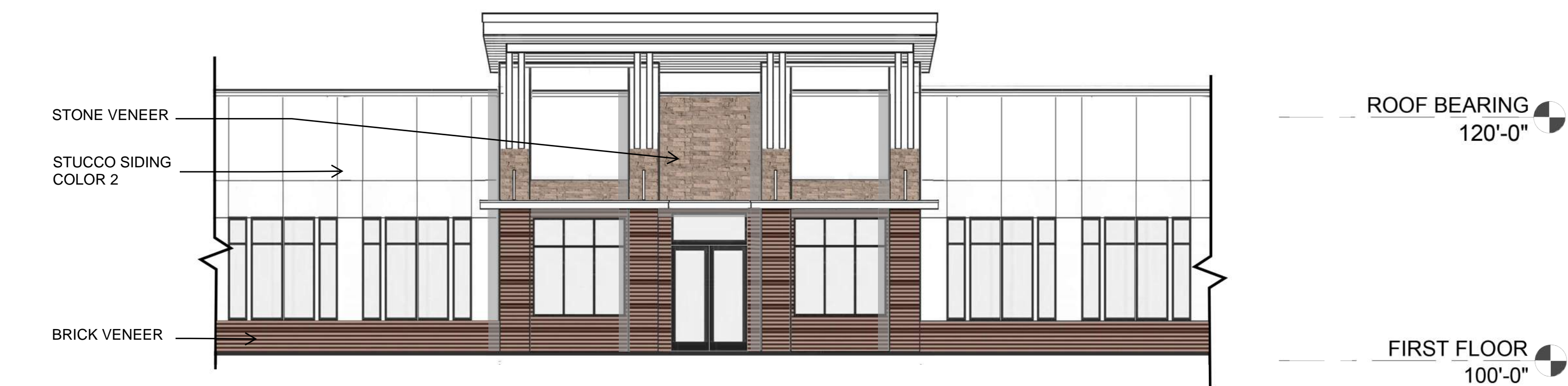
1 TYPICAL ENTRY NORTH ELEVATION 1/8" = 1'-0"