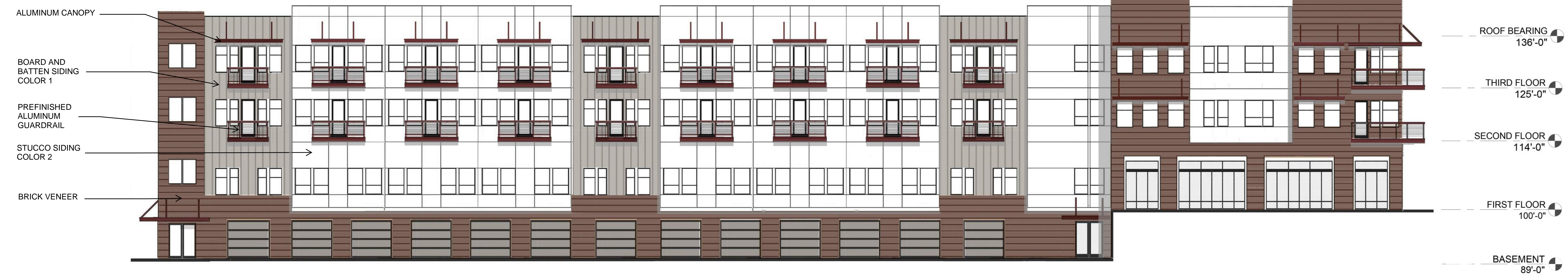
1 BLDG 4 EAST ELEVATION 3/32" = 1'-0"

rosemann & ASSOCIATES P.C. ARCHITECTURE INTERIOR DESIGN ENGINEERING PLANNING 1526 Grand Boulevard Kansas City, MO 64108-1404 p: 816.472.1448 w: www.rosemann.com © 2023 Rosemann & Associates, P.C. DENVER ▲ KANSAS CITY ▲ ST. LOUIS ▲ ATLANTA