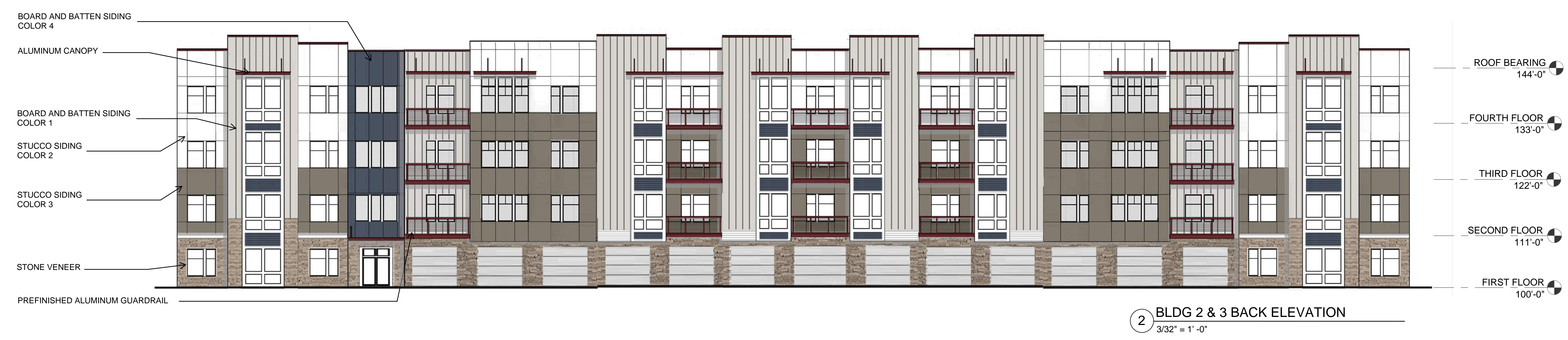
2 BLDG 2 & 3 BACK ELEVATION 3/32" = 1'-0"