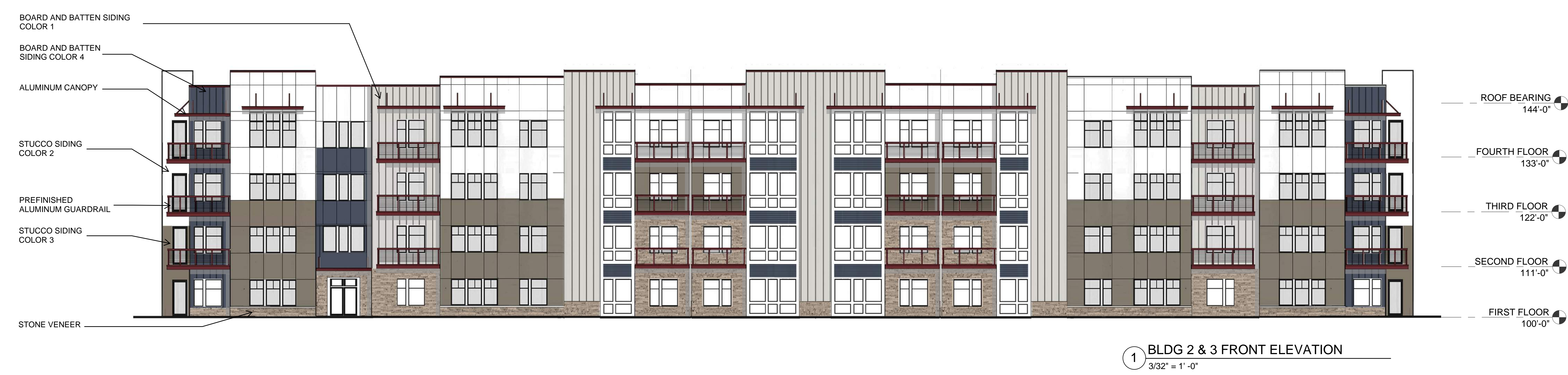
1 BLDG 2 & 3 FRONT ELEVATION 3/32" = 1'-0"