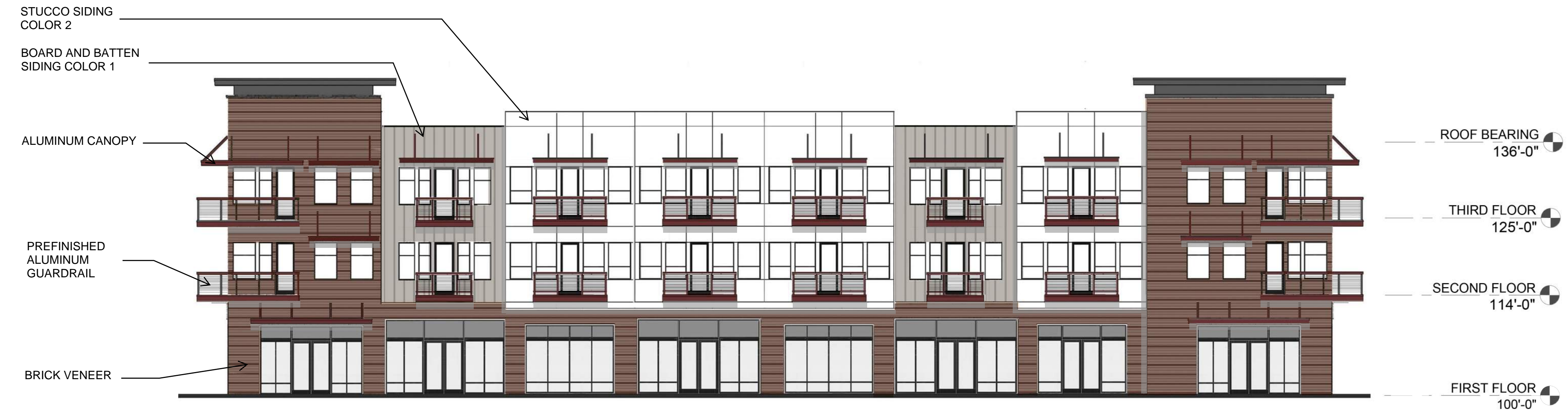
4 BLDG 4 WEST ELEVATION 3/32" = 1'-0"