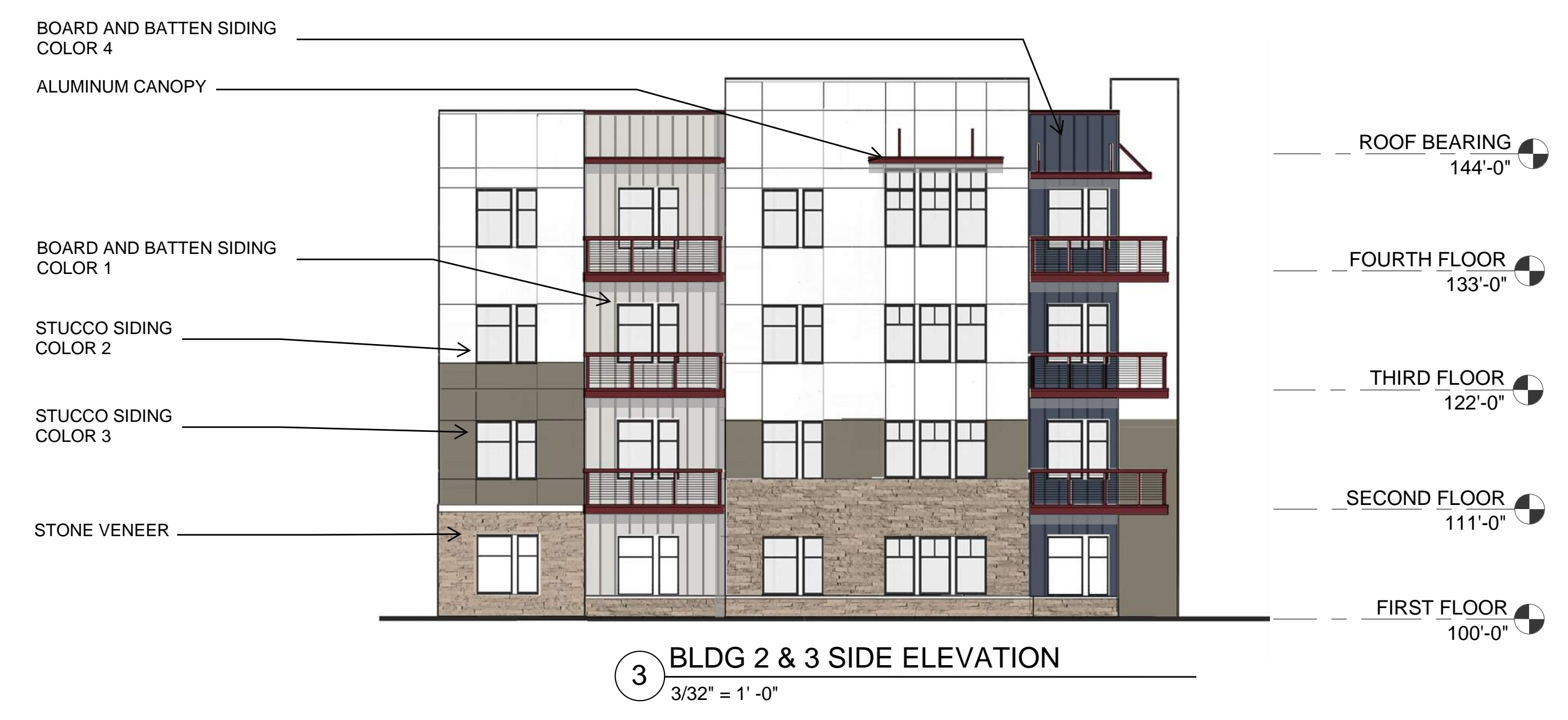
3 BLDG 2 & 3 SIDE ELEVATION 3/32" = 1'-0"