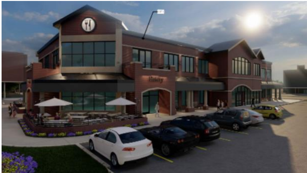
Figure 1 - Typical retail/office building

The proposed development is not expected to negatively affect the aesthetics of the subject project area and or neighboring properties. The developer has submitted design guidelines that will govern architecture and establish a cohesive theme that will carry through and complement future development of the property located south of NE Colbern Rd, north of I-470, east of NE Douglas St and west of NE Main St that will be considered in the future under separate application. Approved materials for the development include brick, cement fiberboard, aluminum and storefront glazing.