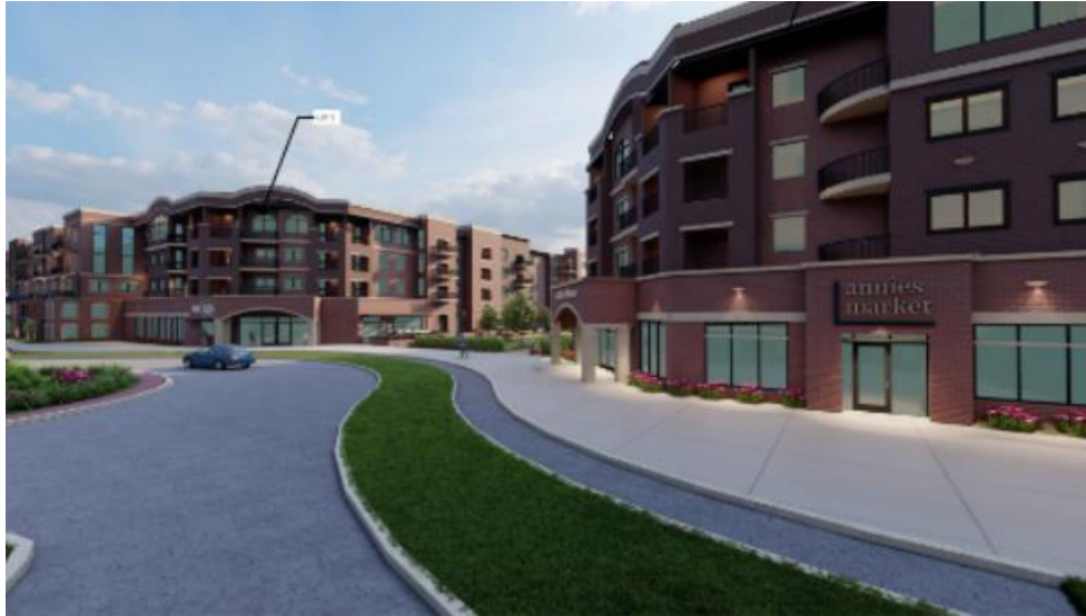
Figure 3 - Typical apartments over commercial