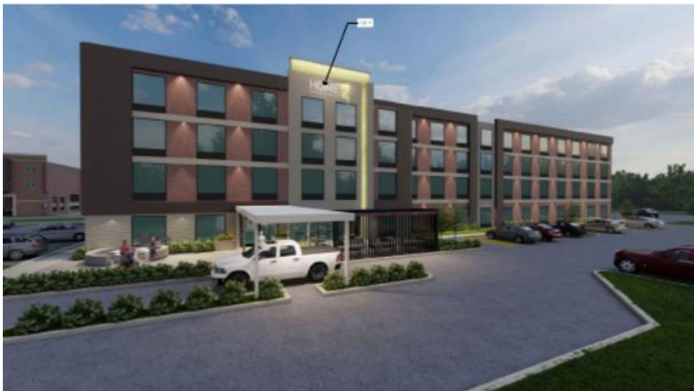
Figure 2 - Typical hotel