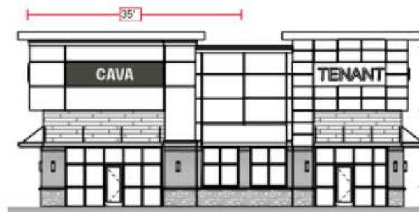
EAST ELEVATION Scale: 3/32" = 1'-0" Wall Area: 26' 6" x 35' = 927.5 sq ft