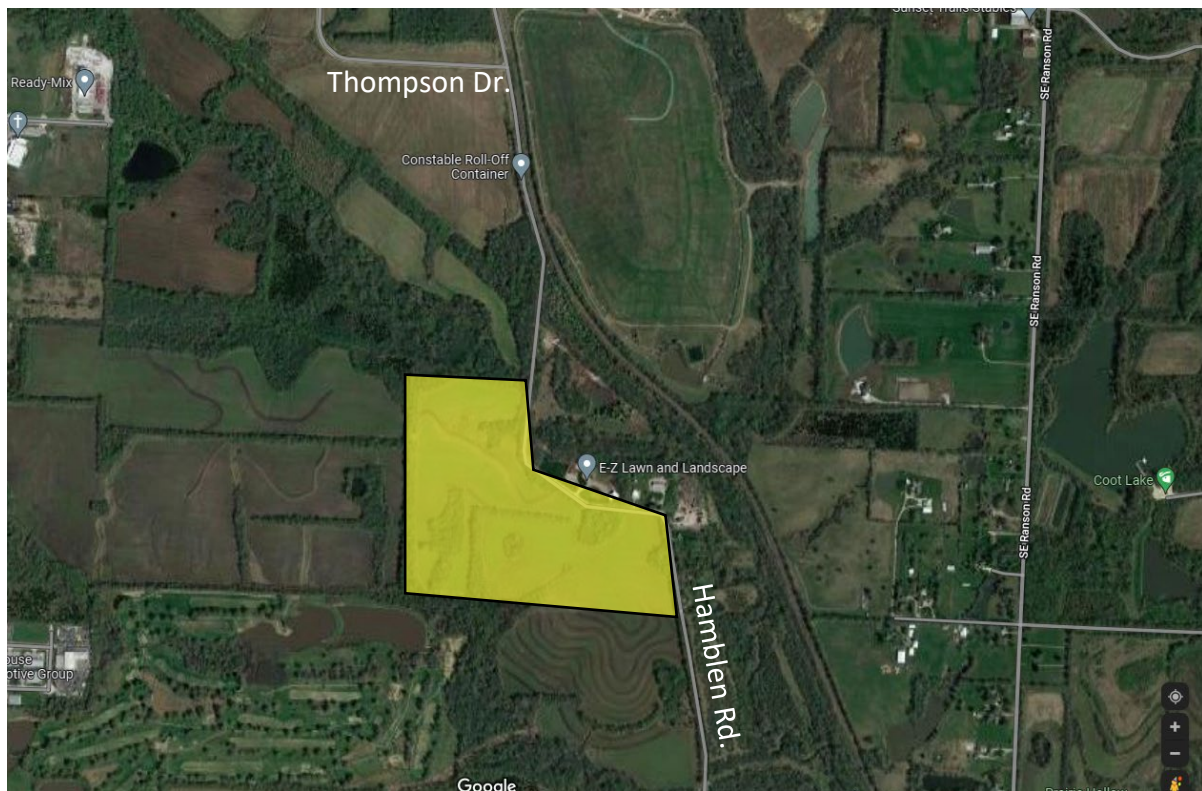
Figure 1: Project Vicinity Map

The purpose of this memo is to document the amount of traffic generated by the Colton's Crossing development, located within Lee's Summit. The development is located on Hamblen Road and shown below in Figure 1 .