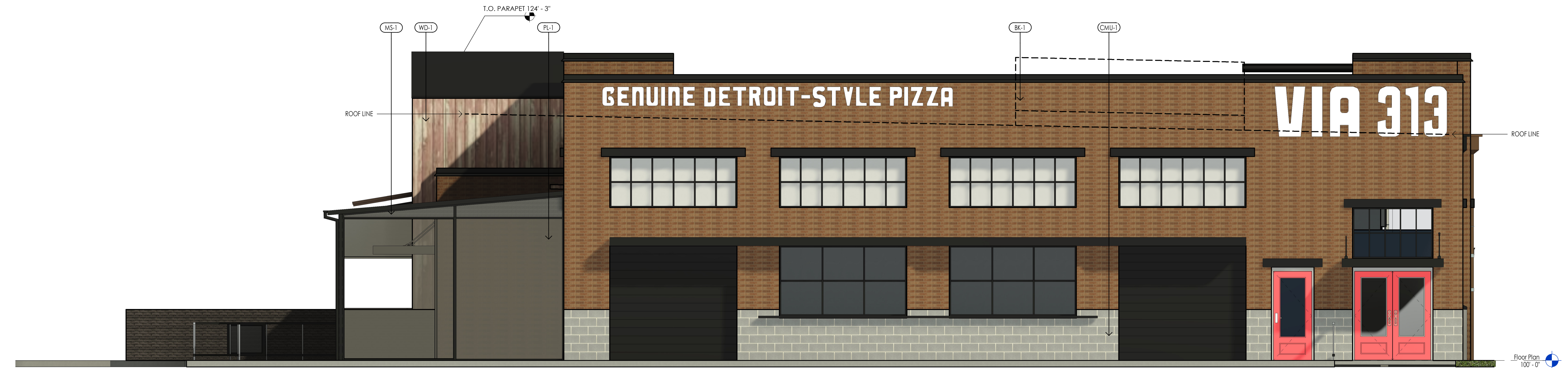
RIGHT ELEVATION (SOUTH) 2 SCALE: 1/4" = 1'-0"