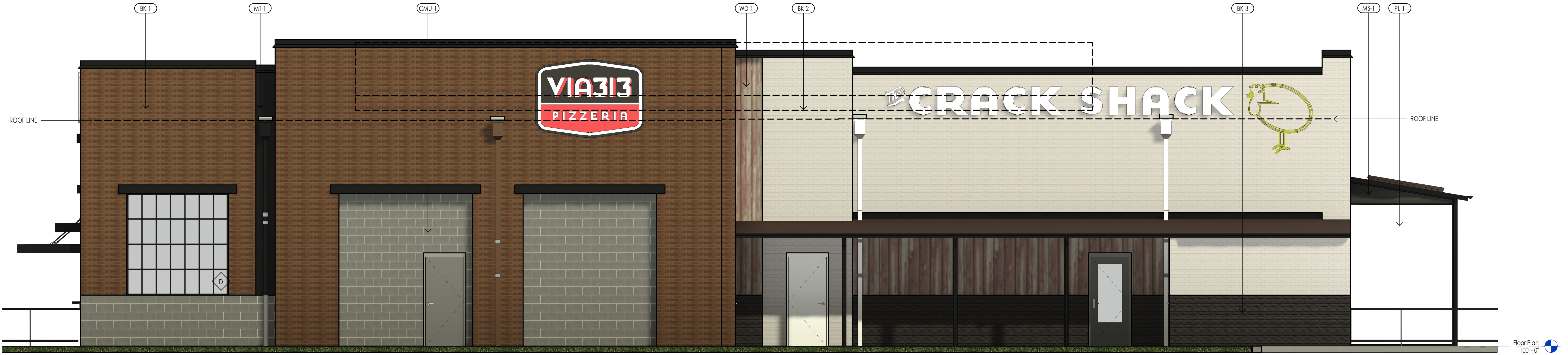
REAR ELEVATION (EAST) 2 SCALE: 1/4" = 1'-0"