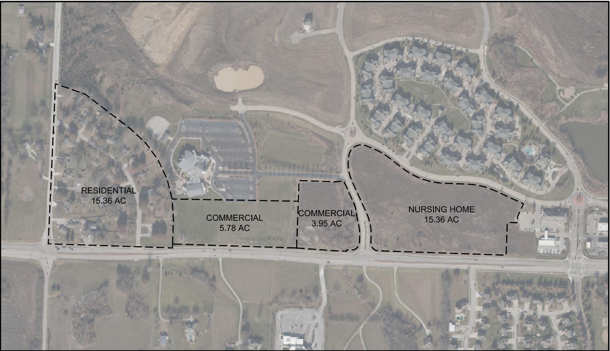
OVERALL DRAINAGE COVERAGE MAP