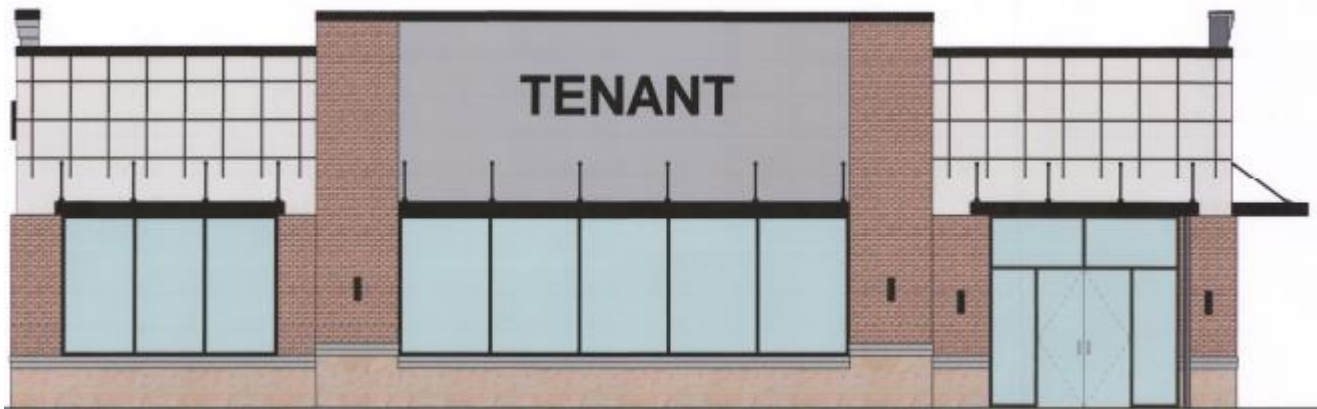
Figure 1 - Previously approved typical commercial front elevation.

The architectural deviation from the previously approved plan necessitating a new preliminary development plan approval is related to the difference in building form and aesthetic. The proposed building architecture employs a specific look for each of the two building tenants. The Crack Shack's exterior has a roadhouse-like architectural look that uses distressed/weathered wood and a white-washed masonry veneer to convey a rustic feel to the fried chicken restaurant. The Via 313 Pizzeria's exterior has a traditional urban commercial/warehouse-like architectural look that primarily uses brick veneer, a significant amount of glass and some metal. Staff supports the proposed building architecture for both restaurant users. The deviation from the previously approved typical architectural style allows each user to express their own architectural language in a manner that creates a unique sense of place and contributes to the architectural interest of the larger development. The images below provide a comparison between the previously approved and proposed architectural styles.