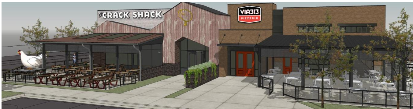
Figure 2 - Proposed front building elevation.