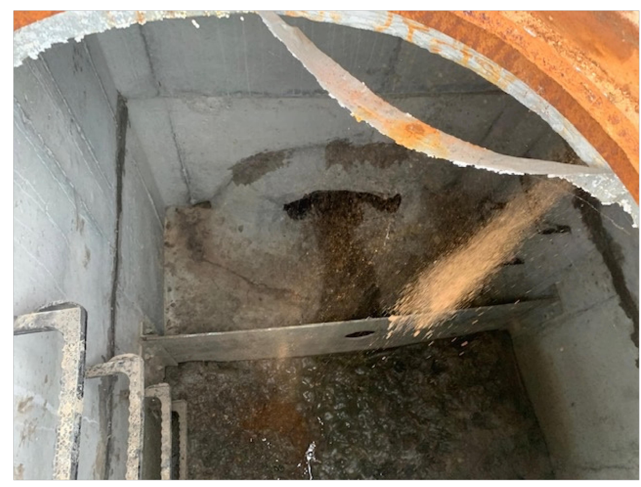
EDD -1 ORIFICE PLATE