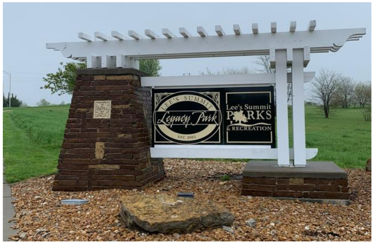
Figure 2 - Existing sign at northeast corner of NE Blackwell Pkwy and NE Legacy Park Dr (middle drive)