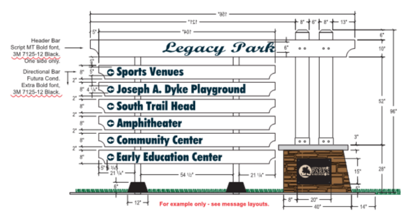
Figure 4 - Typical specification of proposed ground signs

The proposed signs will supplement the existing signs by providing two wayfinding signs at each intersection. NE Blackwell Pkwy is an arterial roadway divided by a landscaped median of varying width. The separation between the northbound and southbound lanes along NE Blackwell Pkwy at the three park entrances are 60' (north entrance) and 180' (middle and south entrances). The two new signs at each intersection will be located on opposite sides of the intersection diagonal from one another—each intended to provide direction for northbound and southbound NE Blackwell Pkwy traffic. The signs are taller, larger and greater in number than the freestanding sign standards allow by right for AG-zoned property.