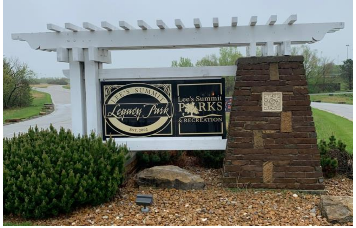
Figure 3 - Existing sign at median entrance of NE Blackwell Pkwy and NE Legacy Park Dr (south drive)