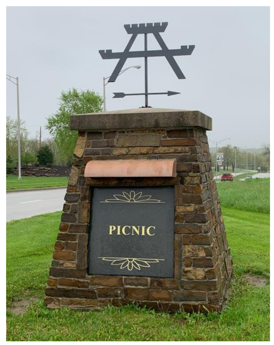
Figure 1 - Existing sign at northeast corner of NE Blackwell Pkwy and NE Coneflower Dr (north drive)

The City of Lee's Summit Parks & Recreation seeks approval of six (6) additional freestanding signs for Legacy Park for the purposes of providing wayfinding for the 692-acre community park. Each of the three park entrances off NE Blackwell Pkwy currently has a single freestanding sign providing general identification of the park, but provide negligible wayfinding information for the various facilities housed within the park.