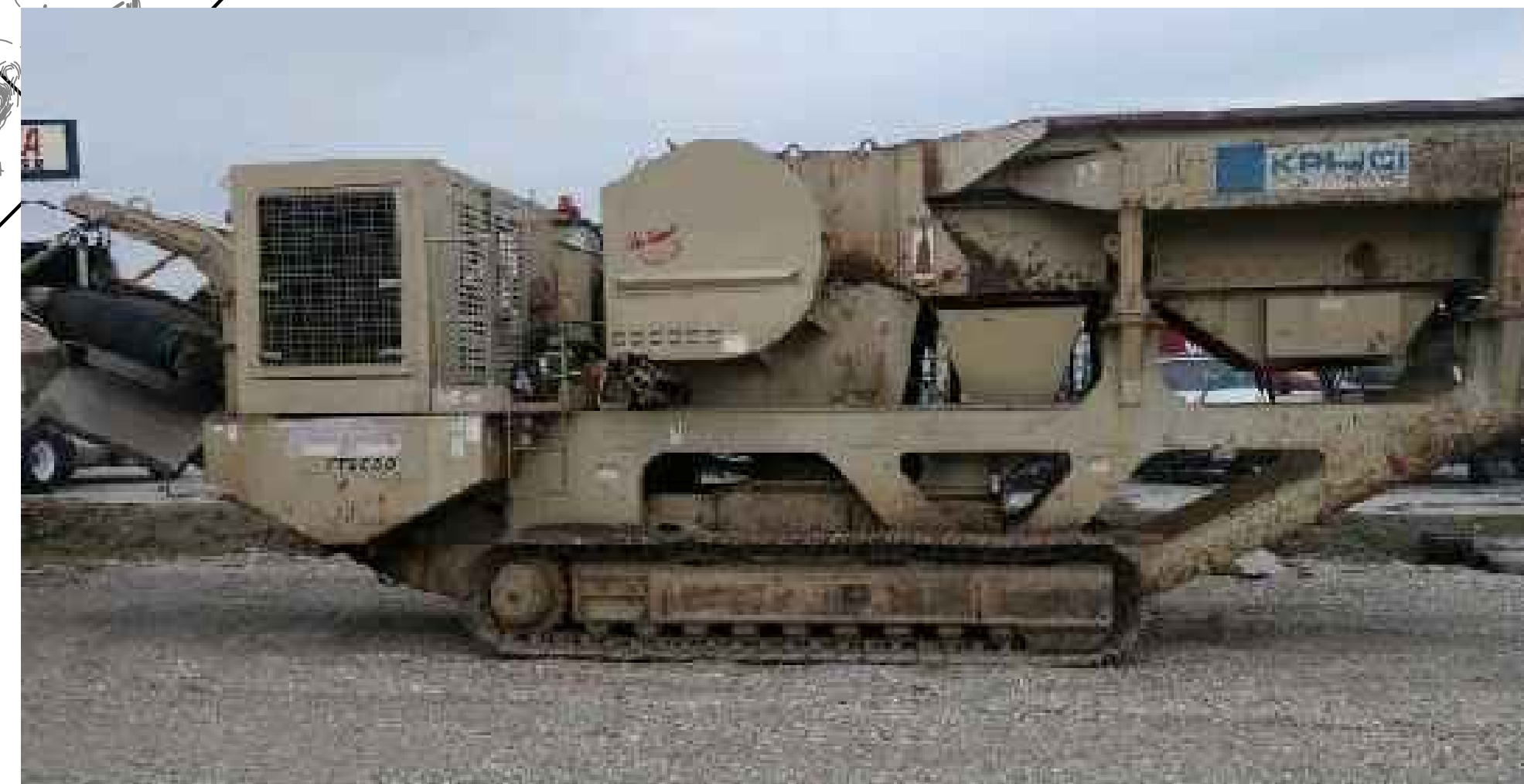
THE ROCK CRUSHER