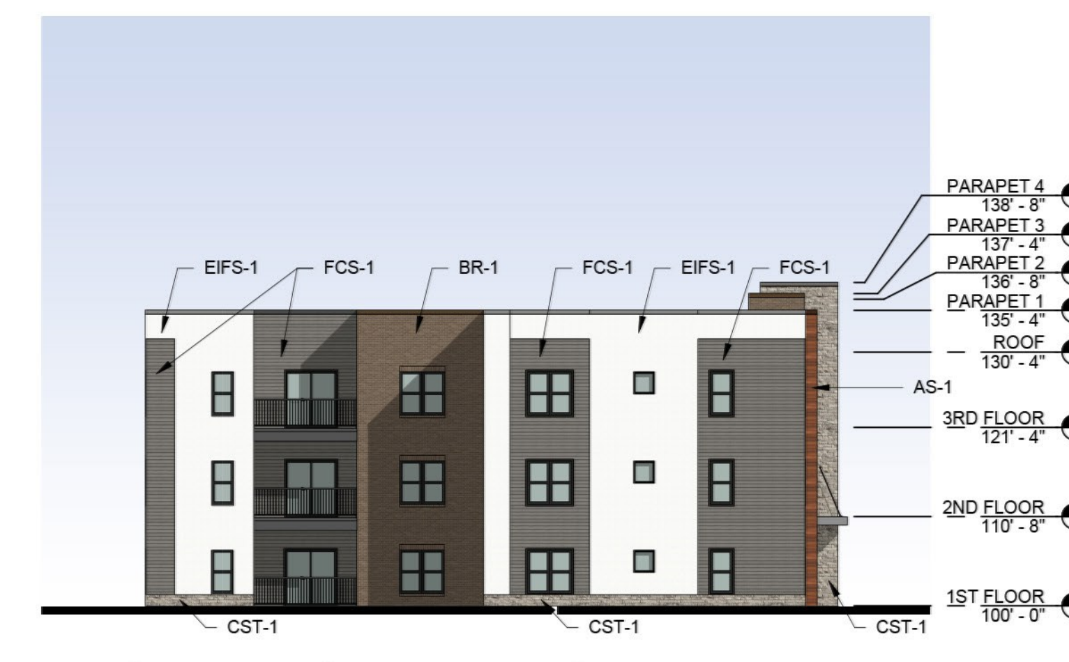
6 NORTHWEST ELEVATION