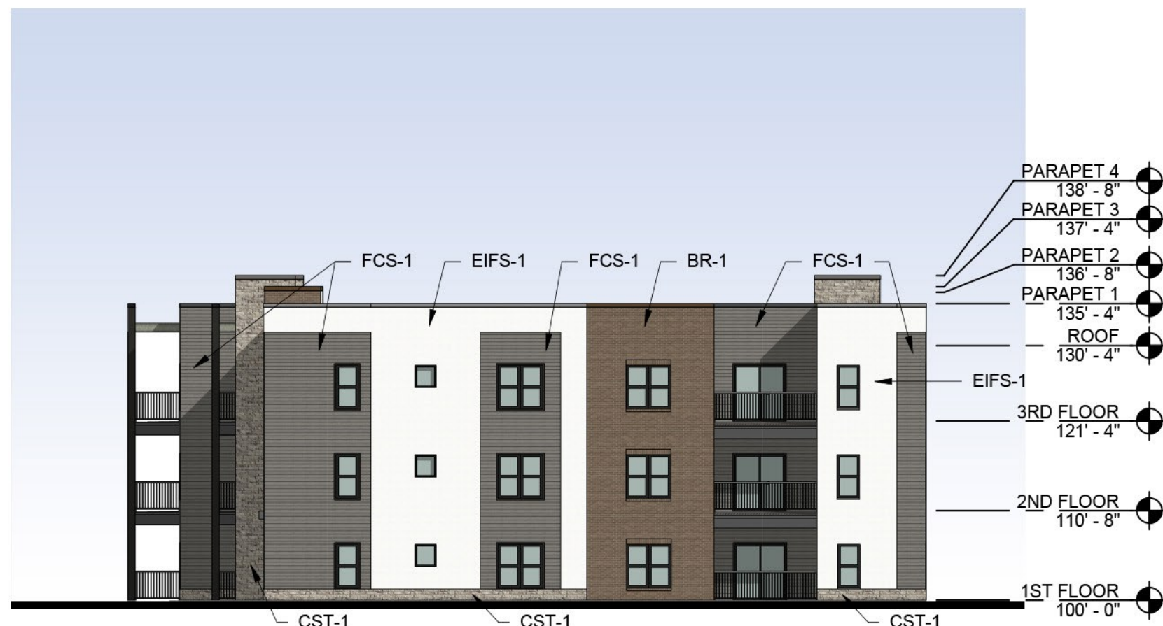
2 PARTIAL EAST ELEVATION (S)