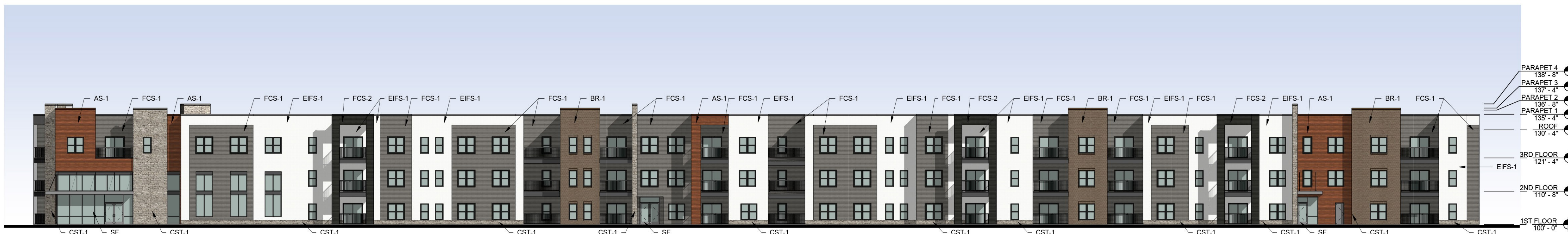
1 SOUTH ELEVATION