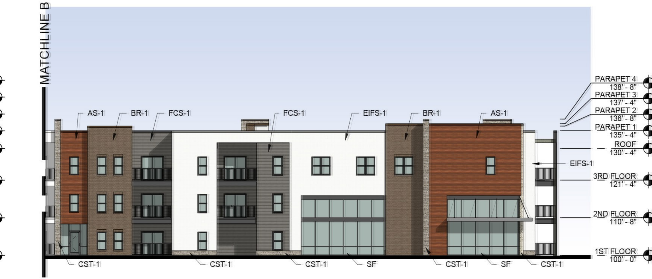
8 WEST ELEVATION