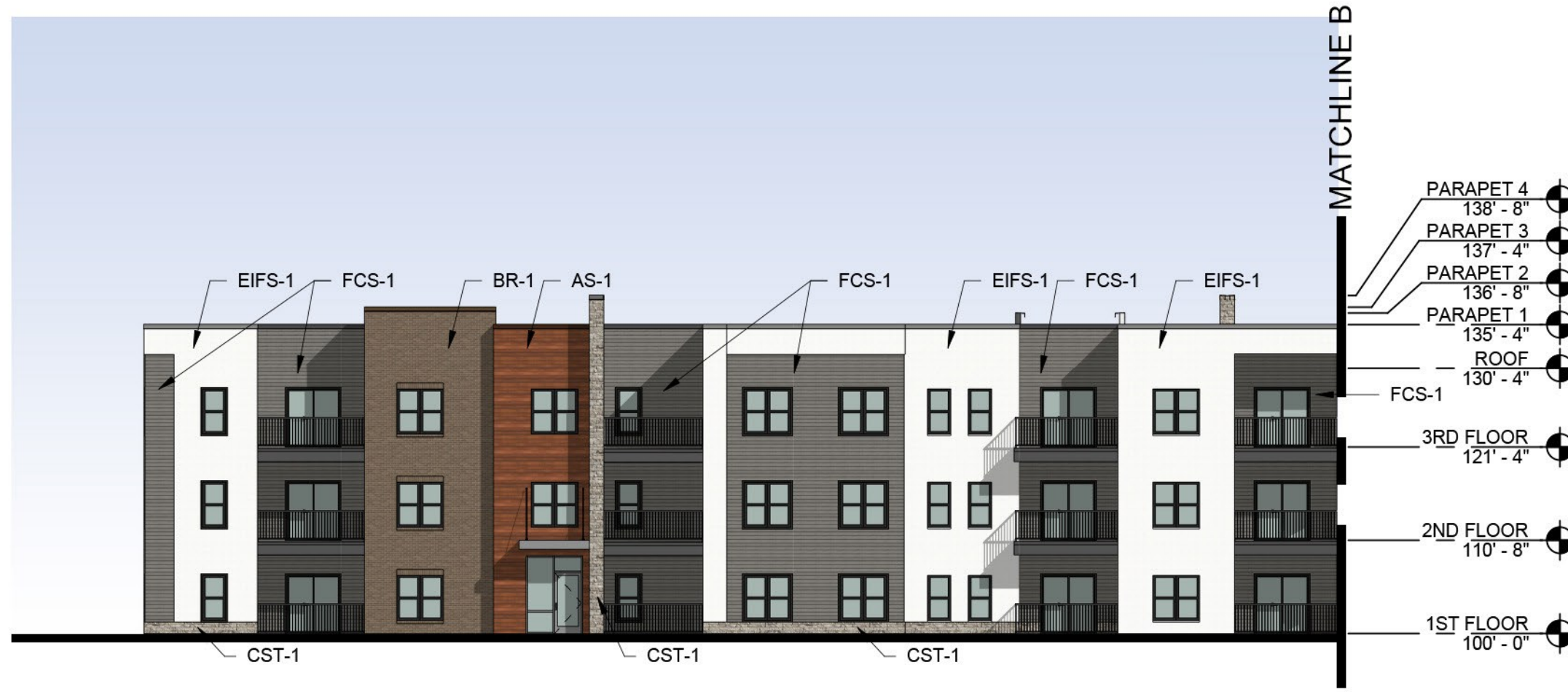
7 SOUTHWEST ELEVATION