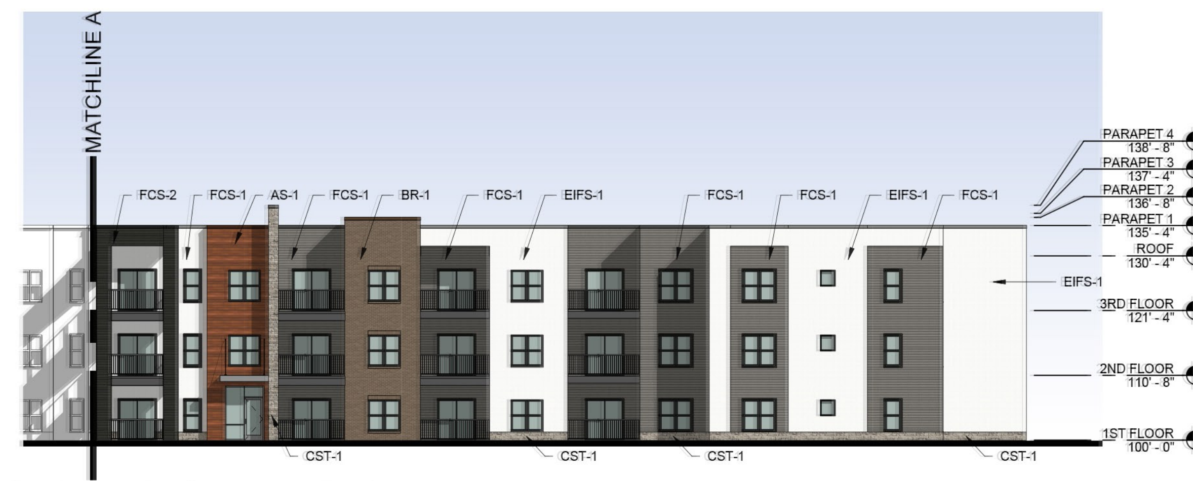
5 NORTHEAST ELEVATION