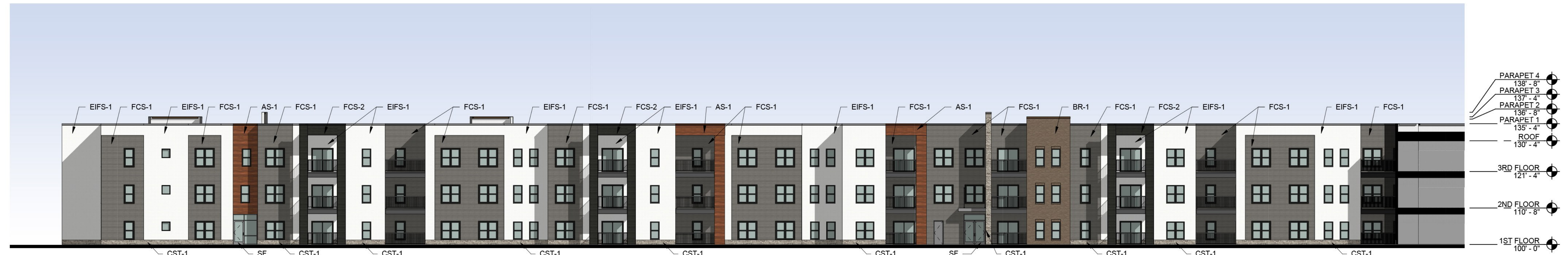
3 NORTH ELEVATION