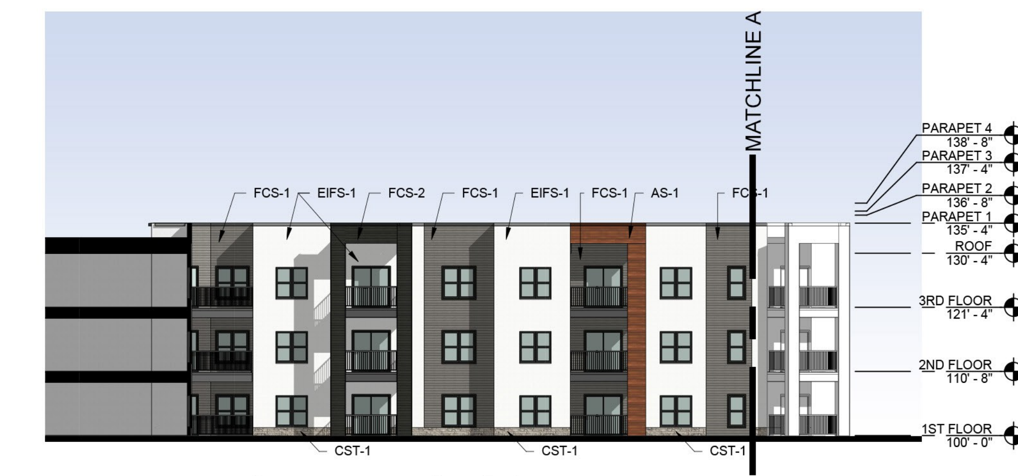
4 PARTIAL EAST ELEVATION (N)