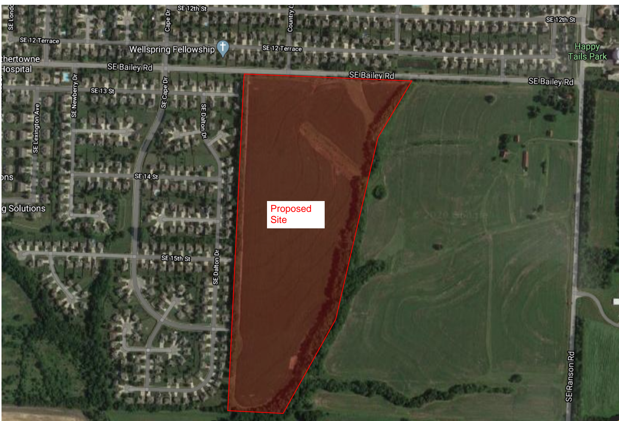
New Lee's Summit Middle School Location Map