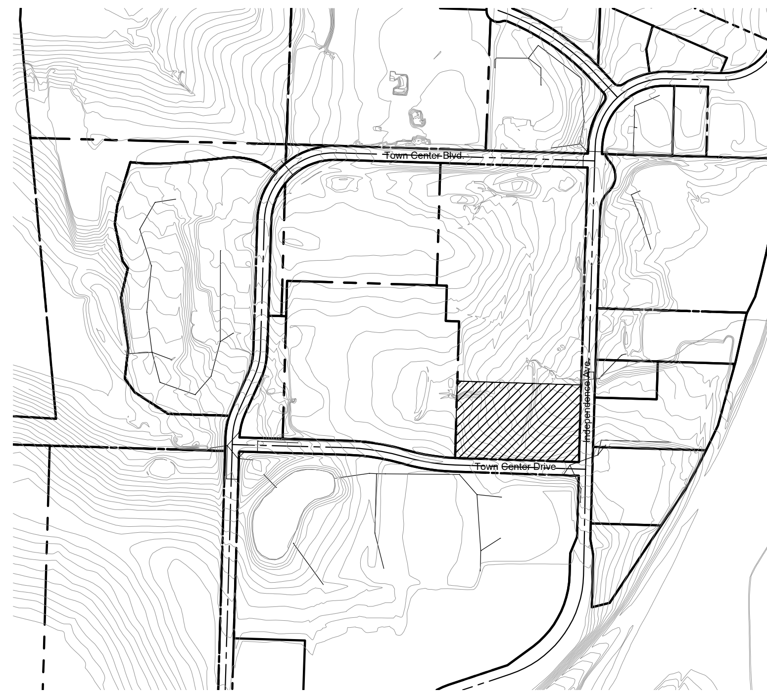
2 Vicinity Plan no scale