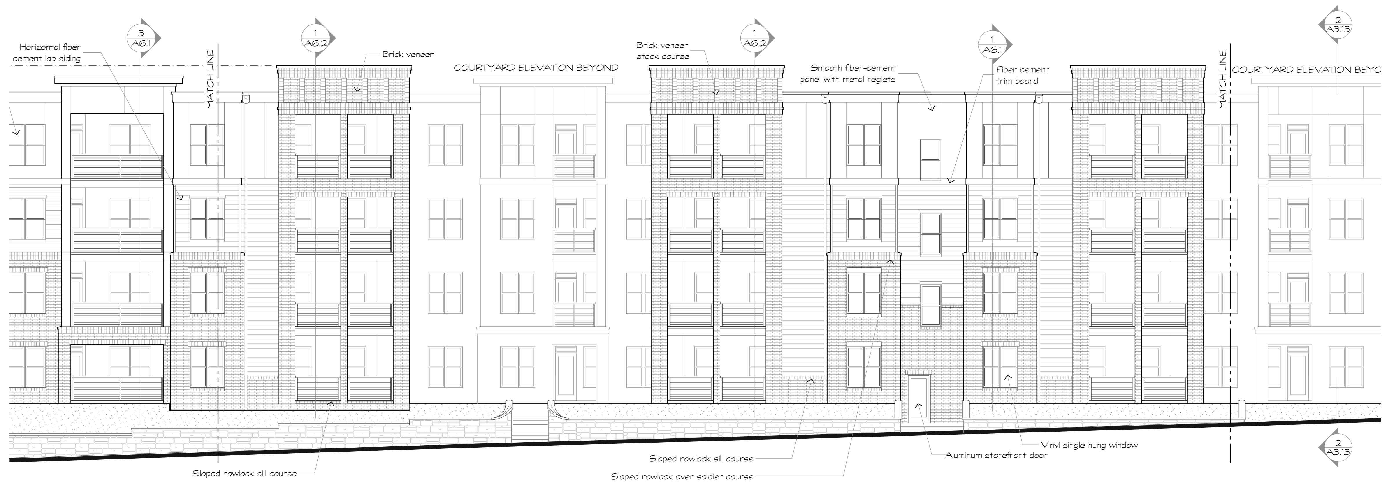
2 Building Elevation - SE Douglas Street Scale: 1/8" = 1'-0"