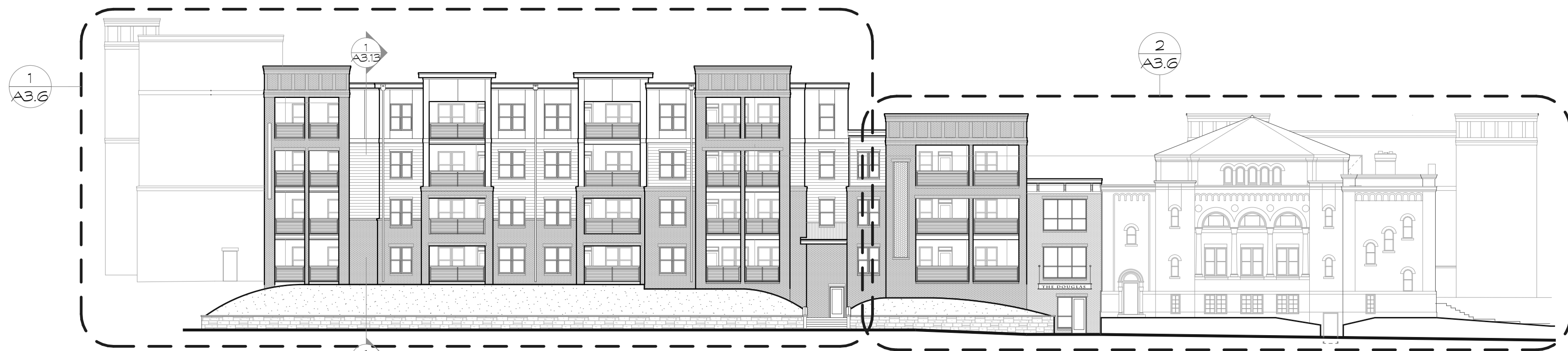
4 Building Elevation (2nd Street) Scale: 1" = 20'

ELEVATION NOTE: PROVIDE VERTICAL CONTROL JOINTS AT MASONRY AT 3/8" MIN. EVERY 24' TYP., UNLESS INDICATED OTHERWISE. ADDITIONALLY, PROVIDE 4/8" MIN JOINT WITH BACKER ROD AND SEALANT AT ALL DISSIMILAR MATERIALS, TYP.