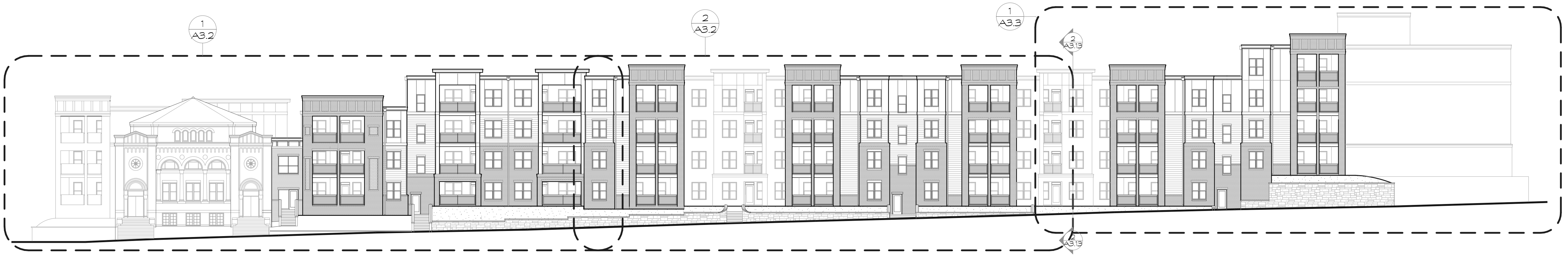
1 Building Elevation (Douglas Street) Scale: 1" = 20'