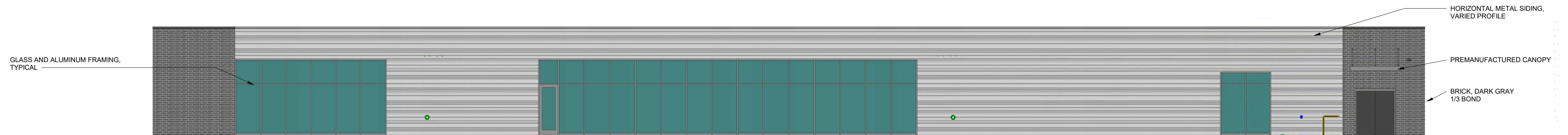
4 NORTH ELEVATION - PDP 1/8" = 1'-0"