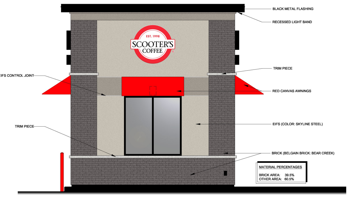
A1 NORTH EXTERIOR ELEVATION SCALE: 3/8" = 1'-0"