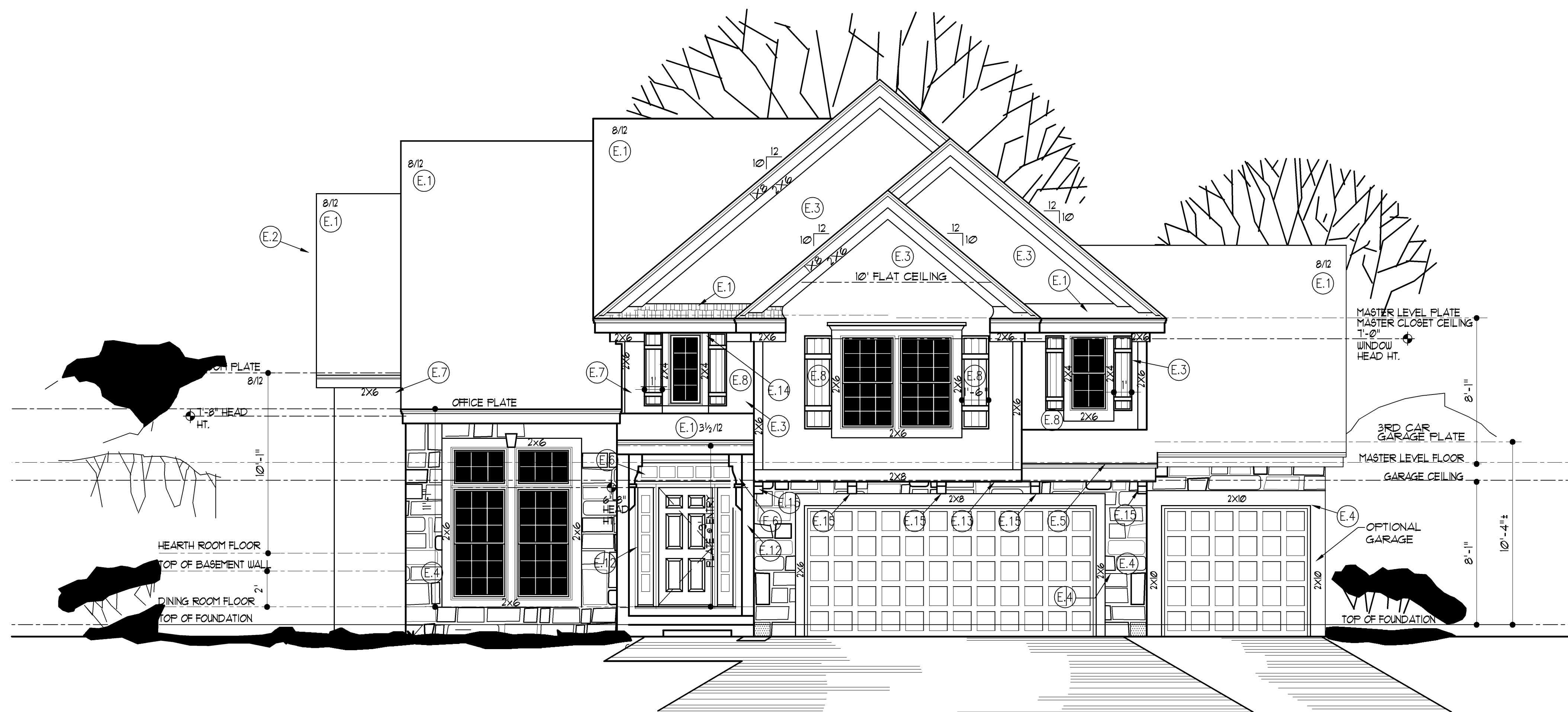
1 FRONT ELEVATION 1/4" = 1'-0"