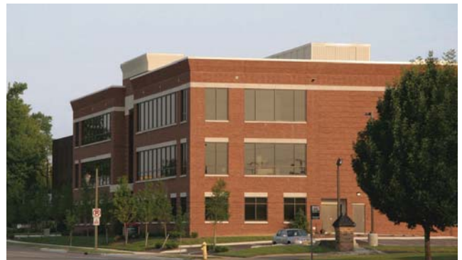
The Ohio State University Foundation - Columbus, Ohio

Envisor equipment screens offer architects the flexibility to create affordable, elegant, customized screening solutions that blend into the overall design, all with no rooftop penetration . Our patented roof screen system provides practical solutions for municipal screening requirements of HVAC units, chillers, air handlers, power exhausts, roof stacks, communication equipment — you name it!