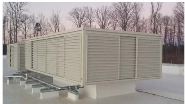
52" Louver Panels

Simply choose your style, panel design, trim option and color and tell us about the units you want to screen then let our project manager take care of it from there.