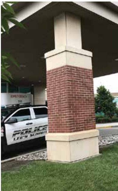
SIDE FACING ENTRANCE NON ILLUMINATED ALUMINUM PANEL PAINTED RED