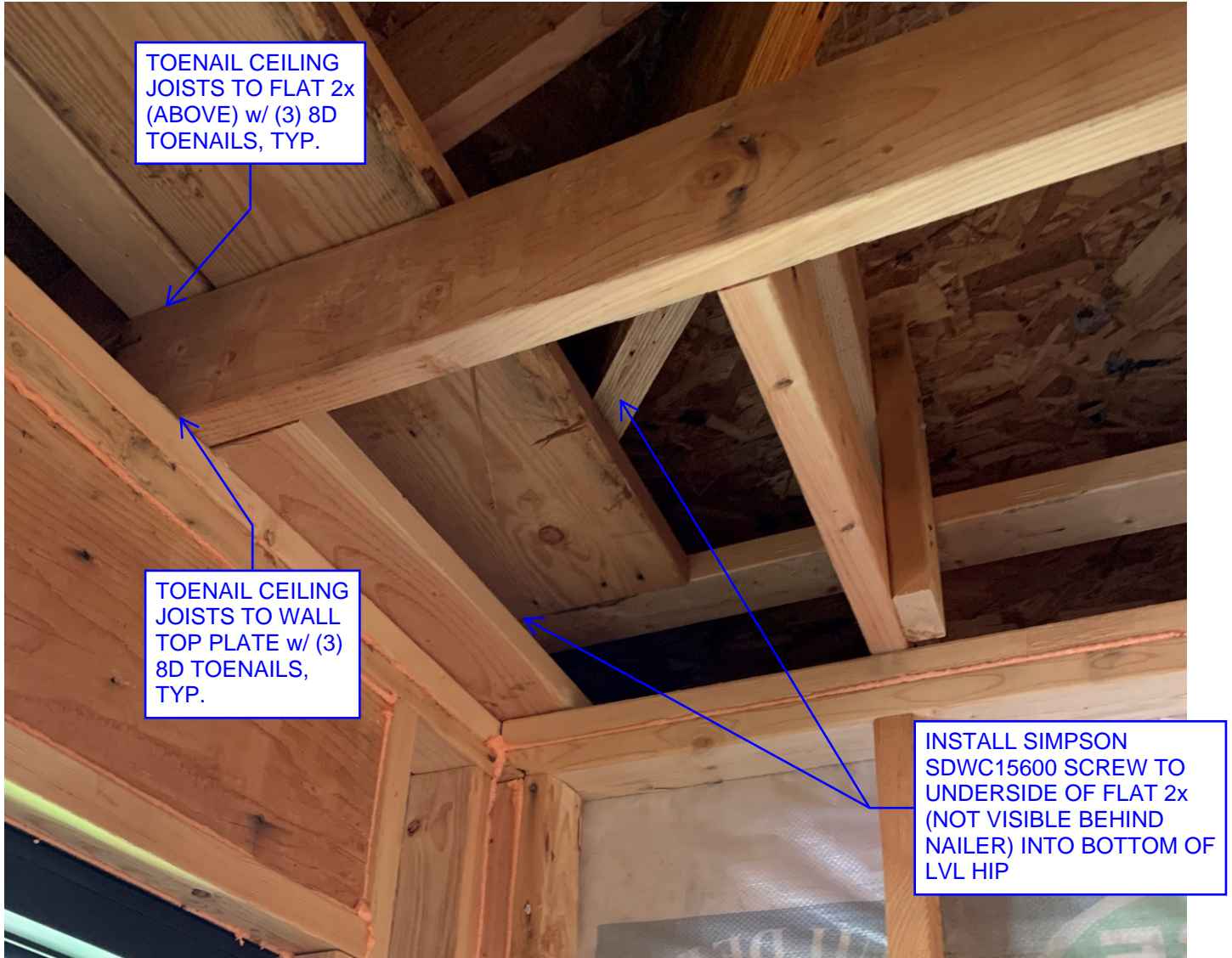
SITE PHOTO #3