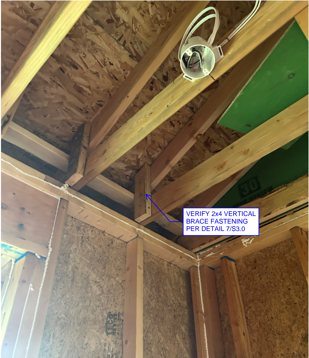
SITE PHOTO #2