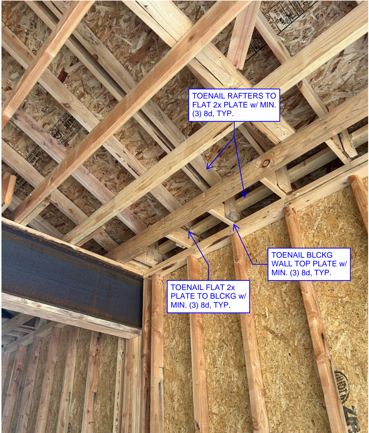
SITE PHOTO #1