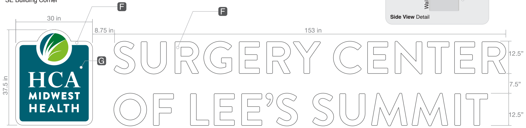
SE Building Corner Signage Front Illuminated logo/letters