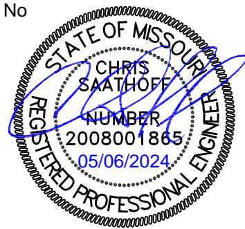
John Hulse, Principal

STRUCTURAL REVIEW HD ENGINEERING & DESIGN HD: 46467 DATE: 5/6/2024