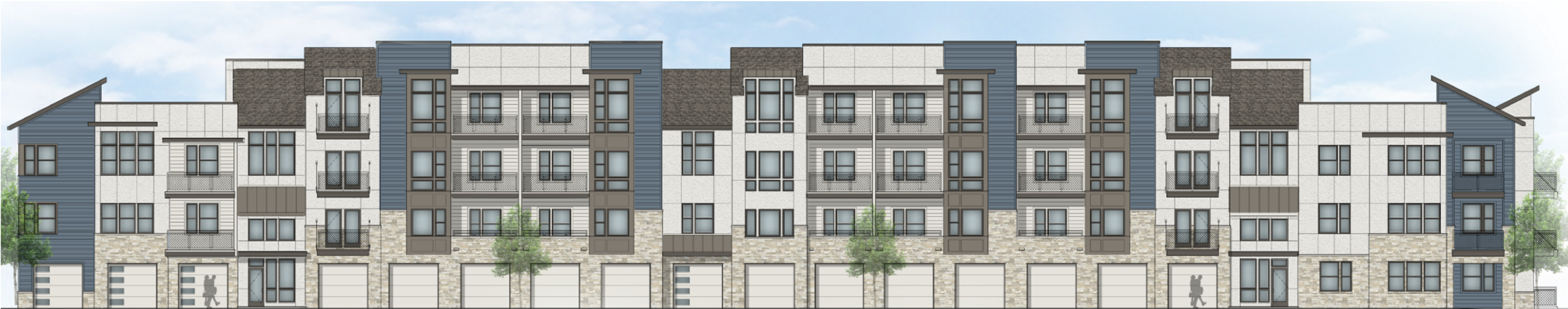
VIEW OF FRONT OF APARTMENT BUILDING N.T.S.