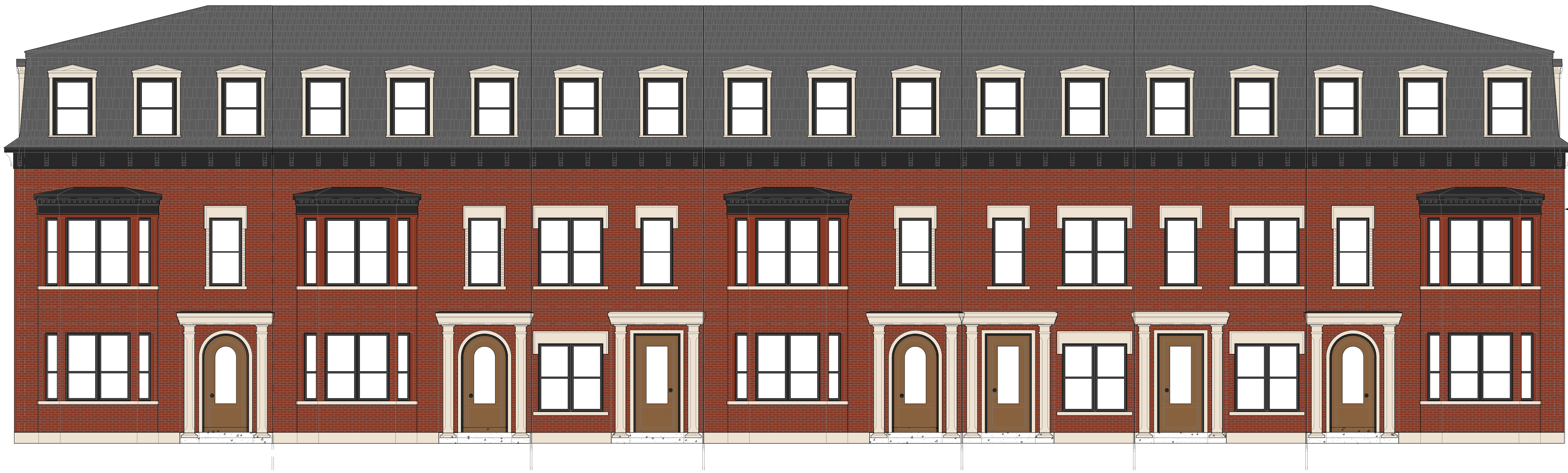
BUILDING 2 - FRONT ELEVATION