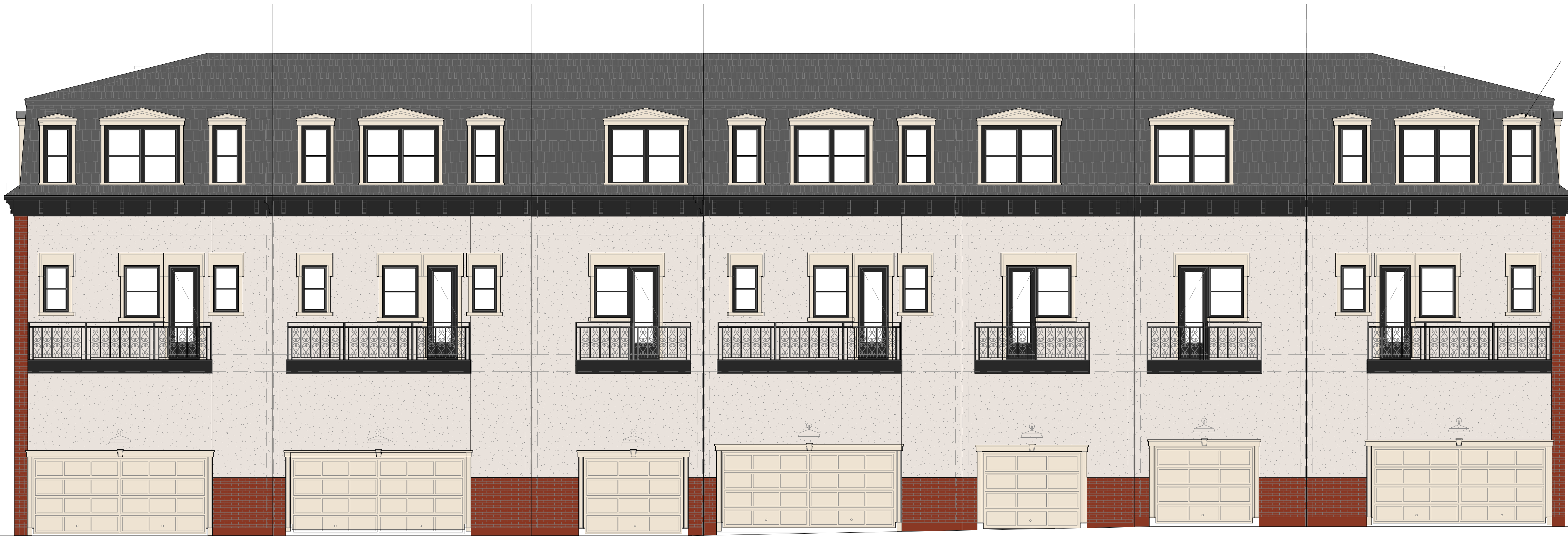
BUILDING 2 - REAR ELEVATION