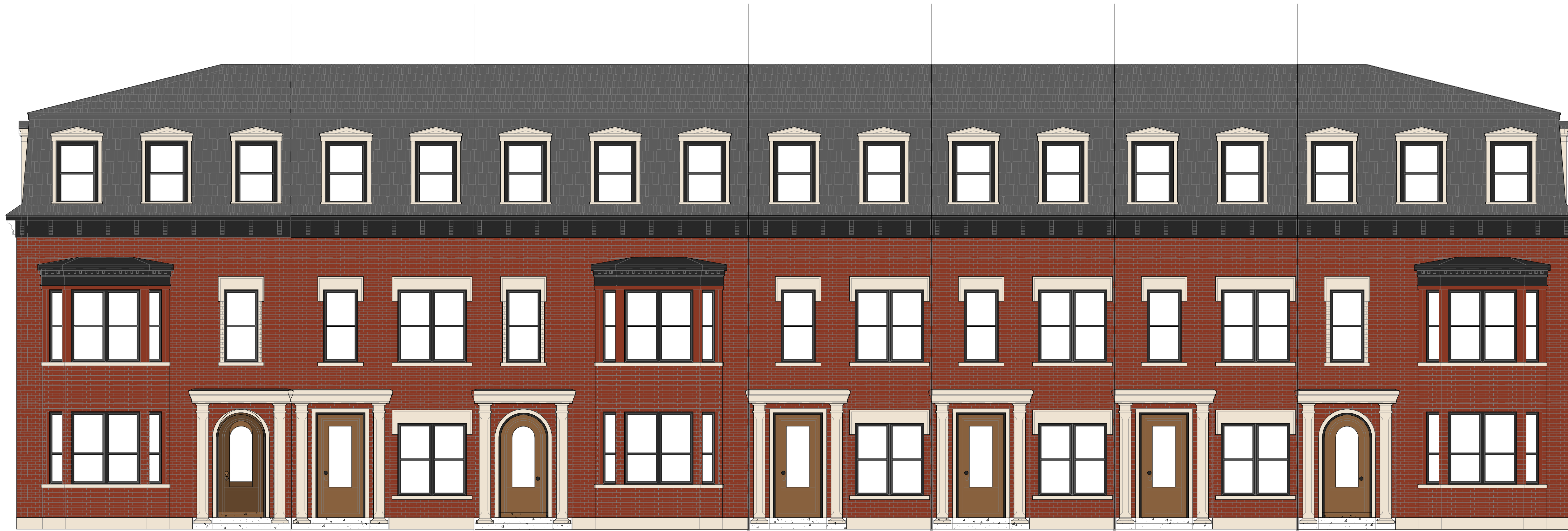
BUILDING I - FRONT ELEVATION