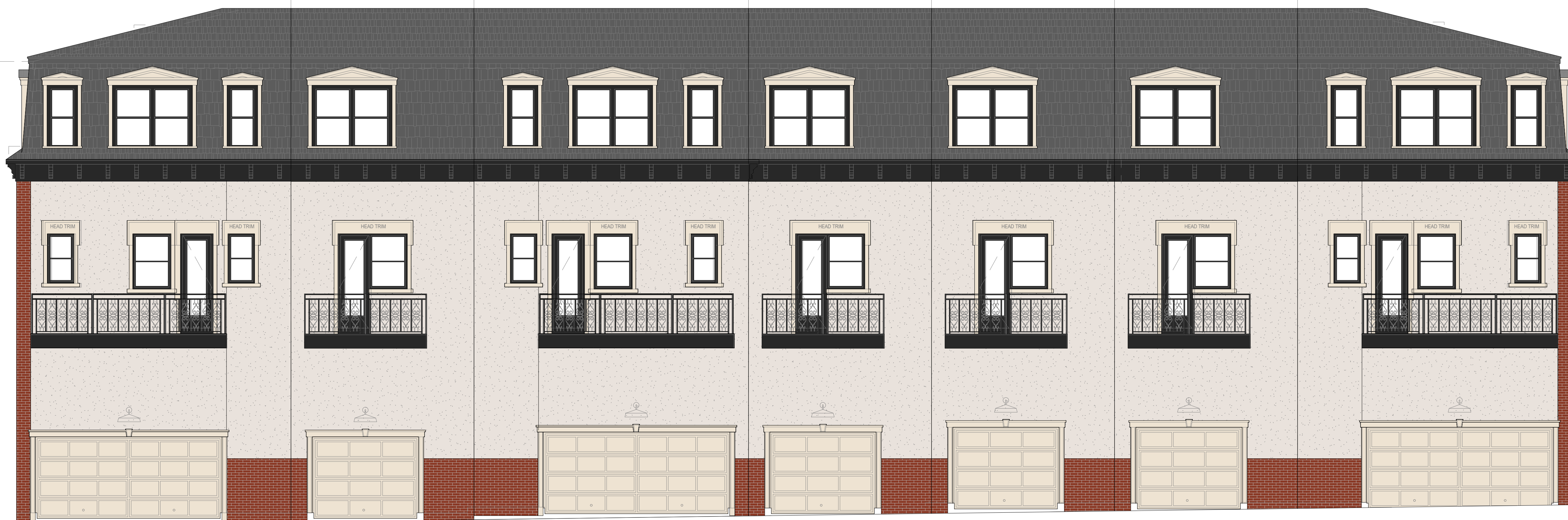
BUILDING I - REAR ELEVATION