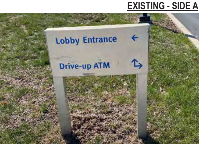
EXISTING - SIDE A

EXISTING DIRECTIONAL TO BE REMOVED; REMOVE SUPPORT POLES TO GRADE & CAP. NEW SIGN TO BE INSTALLED FAR ENOUGH AWAY TO ALLOW FOR NEW FOUNDATIONS.