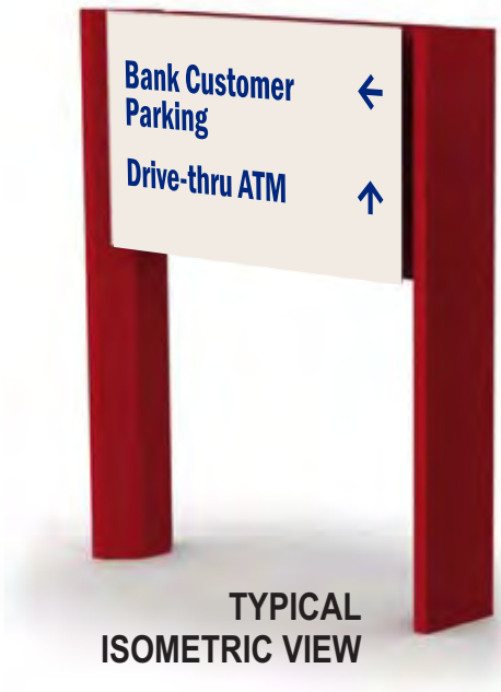
TYPICAL ISOMETRIC VIEW