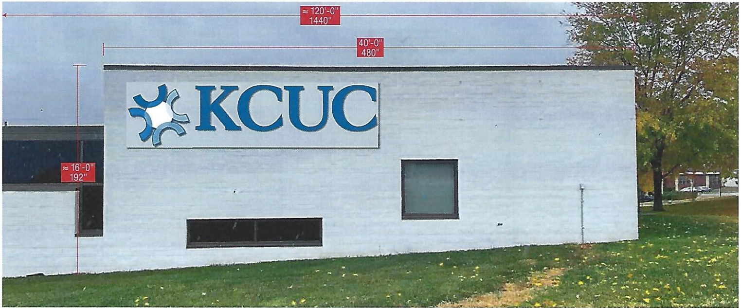
PROPOSED EAST ELEVATION - DAY