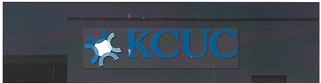
PROPOSED EAST ELEVATION - NIGHT