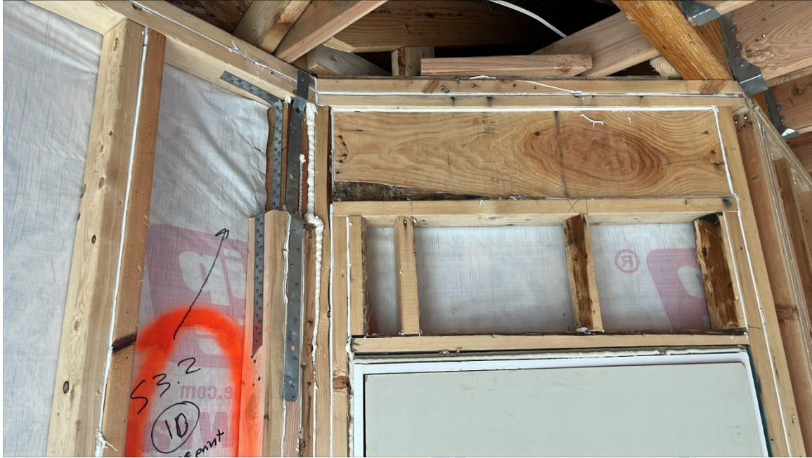
Connection A – header framed into house and attached with strap (left side of covered deck)