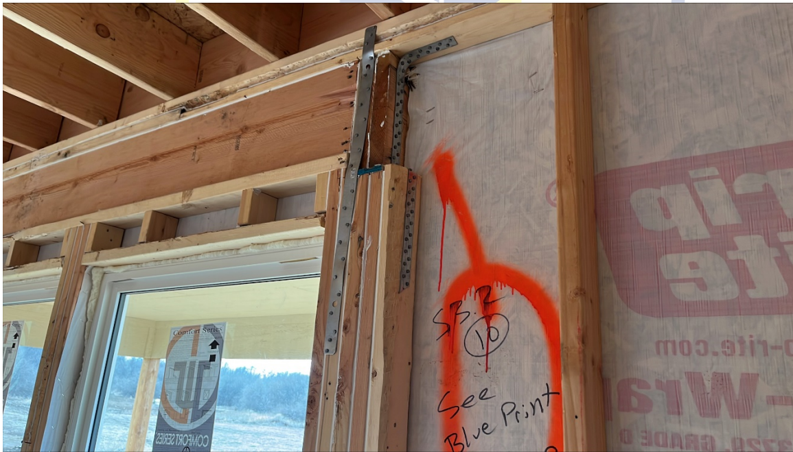
Connection B – header framed into house and attached with strap (right side of covered deck)