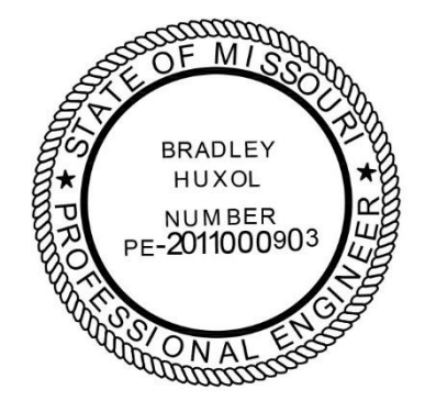
Bradley Huxol, PE