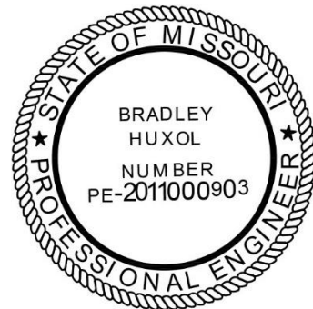
Bradley Huxol, PE