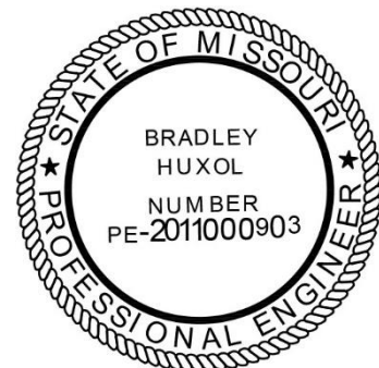
Bradley Huxol, PE