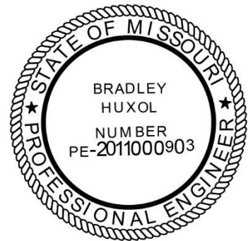
Bradley Huxol, PE