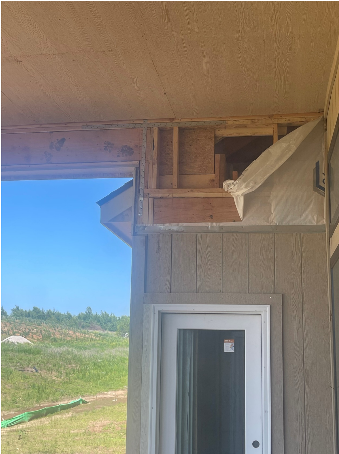
Porch beam extending into house