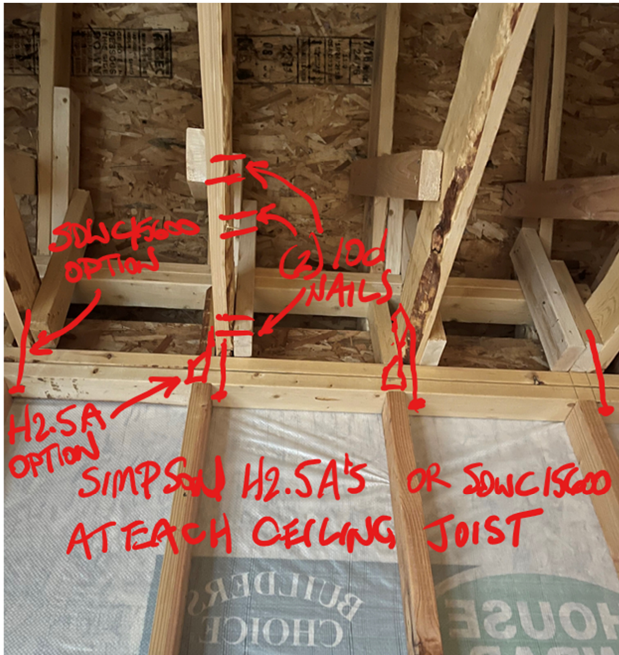
Framing recommendation for item #2 – rafter connections