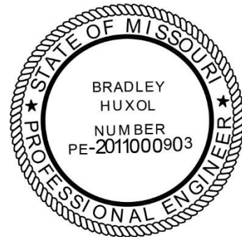
Bradley Huxol, PE