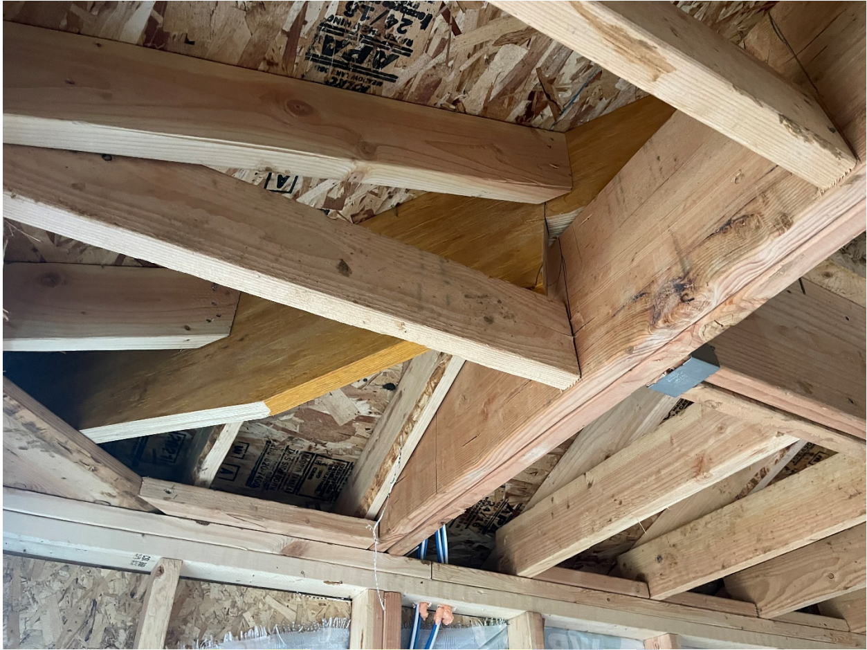
1612 SW 27 th Street – Roof framing above master bedroom