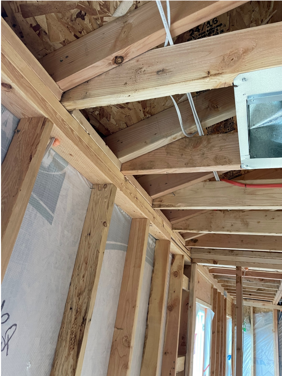
1612 SW 27 th Street – Roof and Ceiling Framing