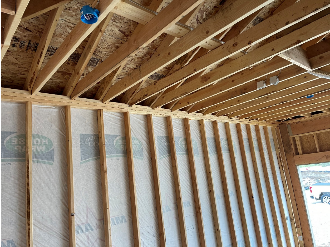
1612 SW 27 th Street – Roof and Ceiling Framing