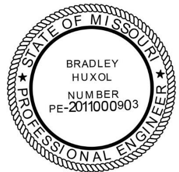
Bradley Huxol, PE