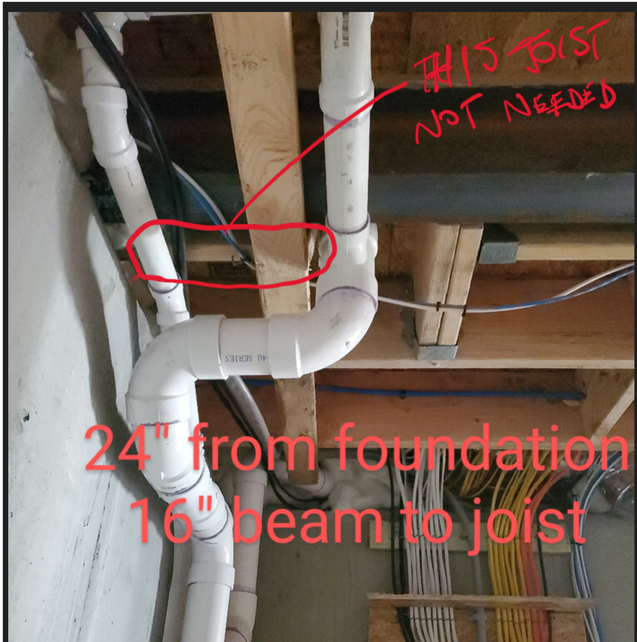
Picture of joist area in question